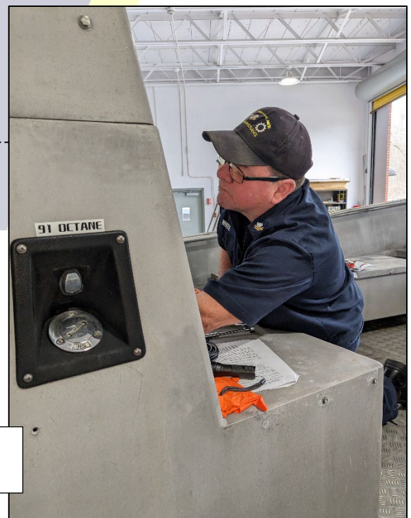
MK2 White traces a ground in the fuel gauge circuit of PB220.