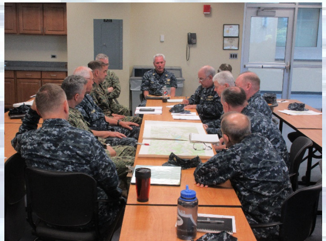
Discussion during Tabletop exercise at Leadership Conference, Latham, September 2017

“Our group learned some valuable lessons