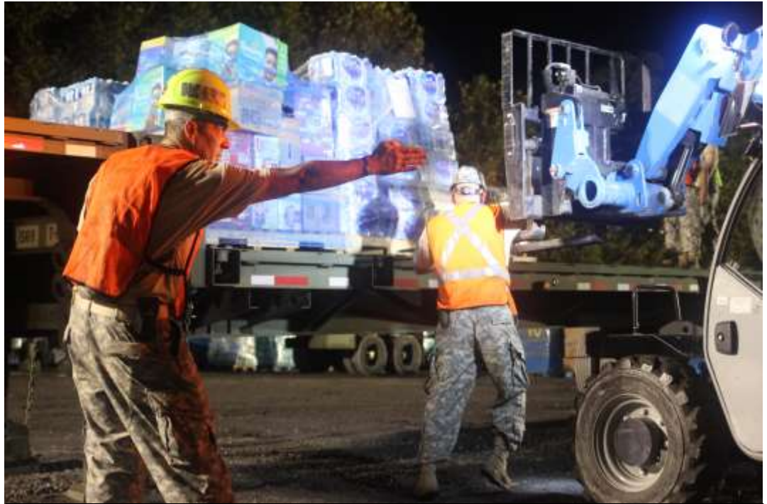
New York Guard members load bottled water donated by people across the state for Puerto Rico relief onto a flatbed at Camp Smith Training Site on Oct. 9. Seventy New York Guard members have been placed on State Active Duty to help package and process donations.

Since day one, the New York Guard and Army National Guard efforts have been a 24-hour operation, working around the clock to consoli-