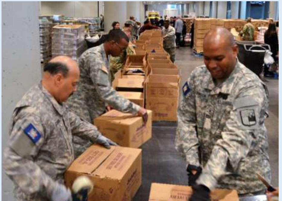
On November 20 and 21, soldiers and airmen from the New York National Guard Joint Task Force Empire Shield, along with soldiers from the NY Guard State 88AC, 56AC and Headquarters Company assisted in the preparing and packing of over 2800 boxes of Thanksgiving food at the Jacob Javits Center in Manhattan as part of Governor's Office NY Holiday Giving event.