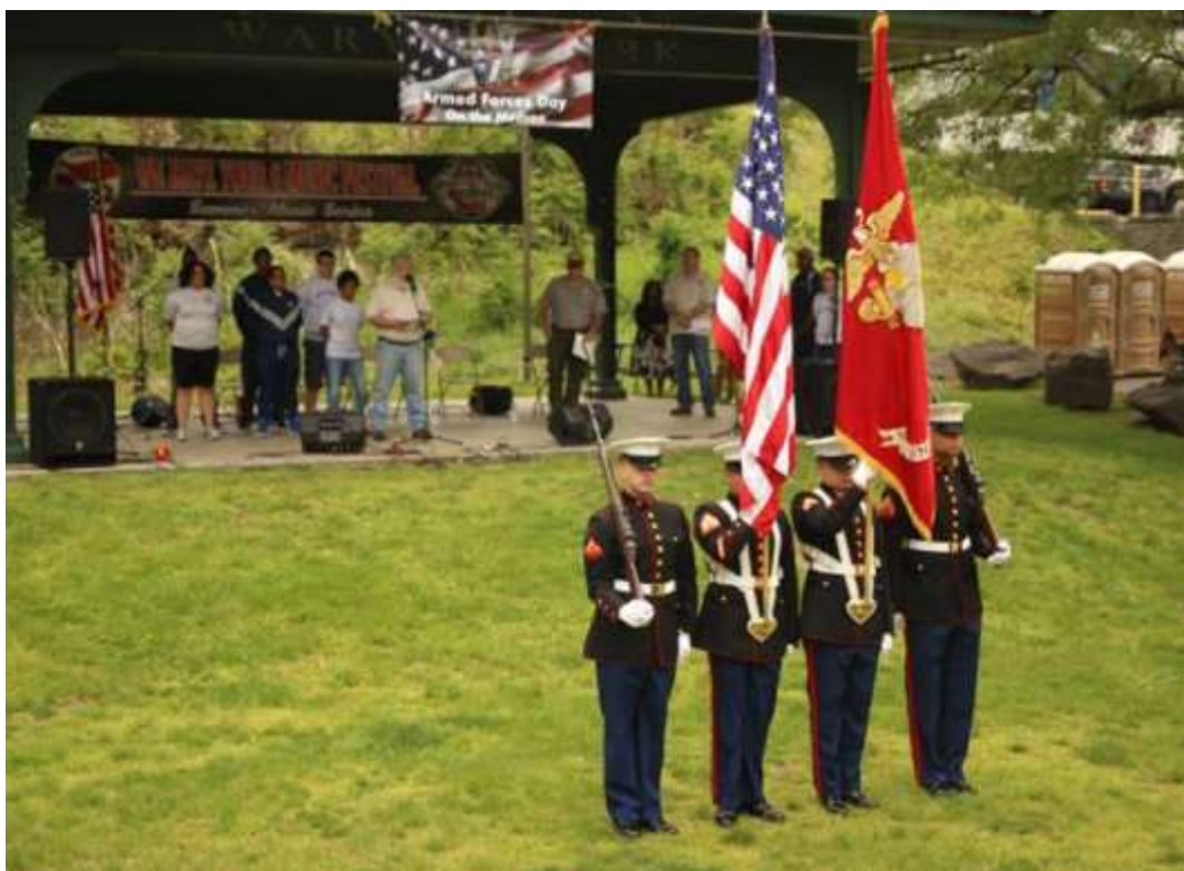
United States Marine Corps Color Guard during opening ceremonies, on 20 May 2017 in Poughkeepsie, NY.