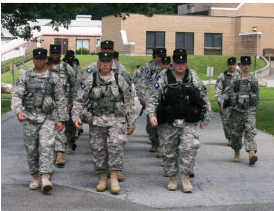
Soldiers of PLDC Class 2017-01 return from a FTX in formation during their final days of the Primary Leadership Development Course.

The New York Guard is a force of 500 uniformed volunteers, organized as a military unit, who augment the New York National Guard during state emergencies. They provide administrative and logistics support to the National Guard.