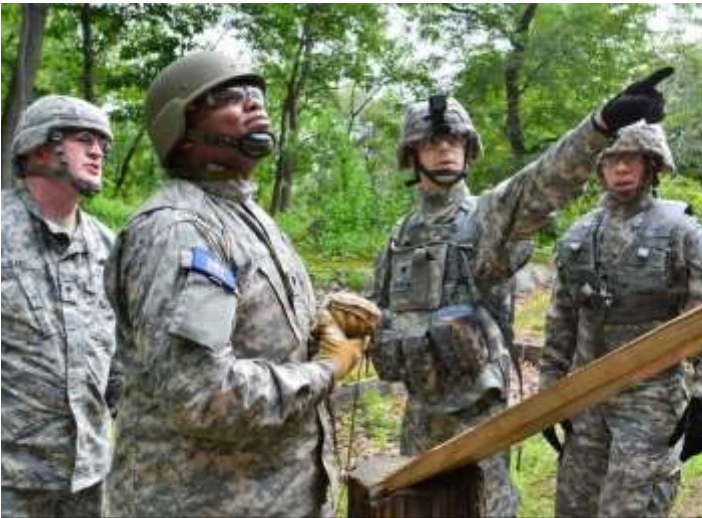
Soldiers of PLDC Class 2017-01 move through the Leadership Reaction Course at Camp Smith during Annual Training 2017.