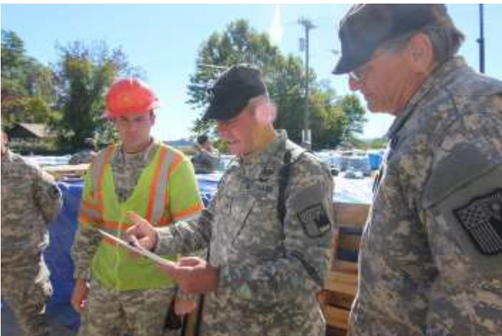
NY Guard NCOs on State Active Duty review inventory lists and discuss the plan for the day.

The mission is expected to continue as long as the volume of donations from the public warrant the New York Guard's logistical support, and will continue into 2018 .