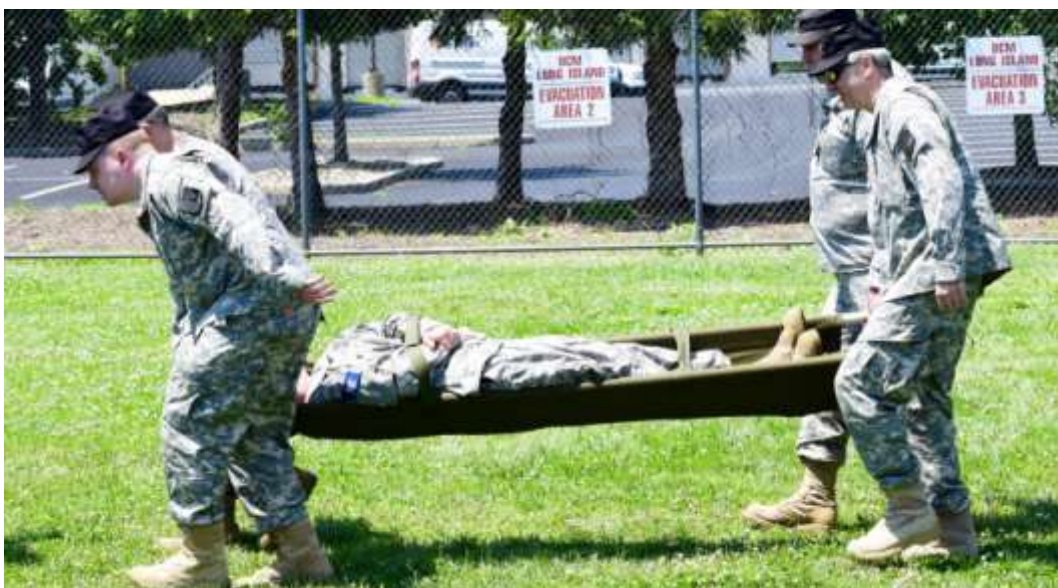
Soldiers of the 88th Area Command conduct a Mass Casualty Exercise concurrent to the 25 June MERNEX.

The motto of the US Army Signal Corps has not been lost on the New York Guard’s 88AC MERN Unit – Pro Patria Vigilans or Watchful for the Country holds as true as ever.