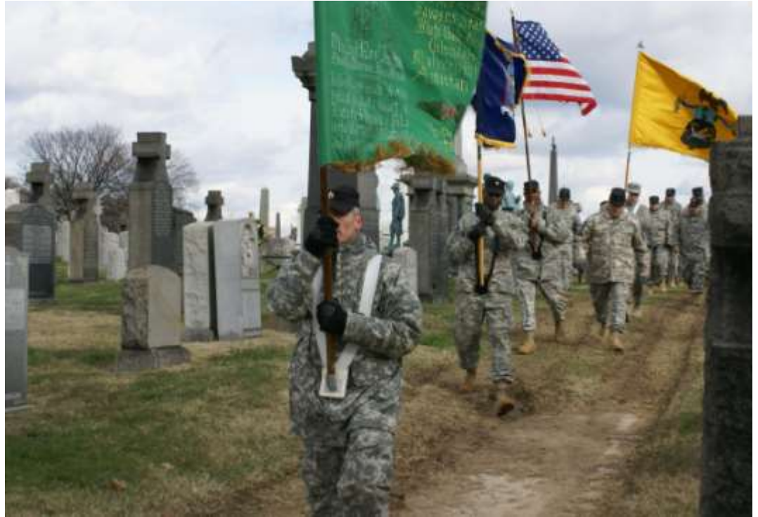
Members of the 88th Brigade, New York Guard, at Calvary Cemetery in Queens, NY.