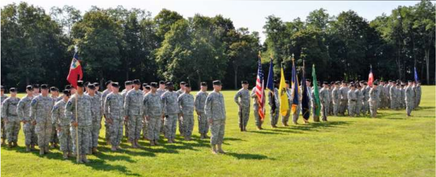
New York Guard in formation during the unveiling of plaque Commemorating their Centennial Celebration during their Annual training in August 2017 at Camp Smith Training Site.

memorating the 100th Anniversary of the New York Guard from the Governor of New York, Andrew Cuomo.