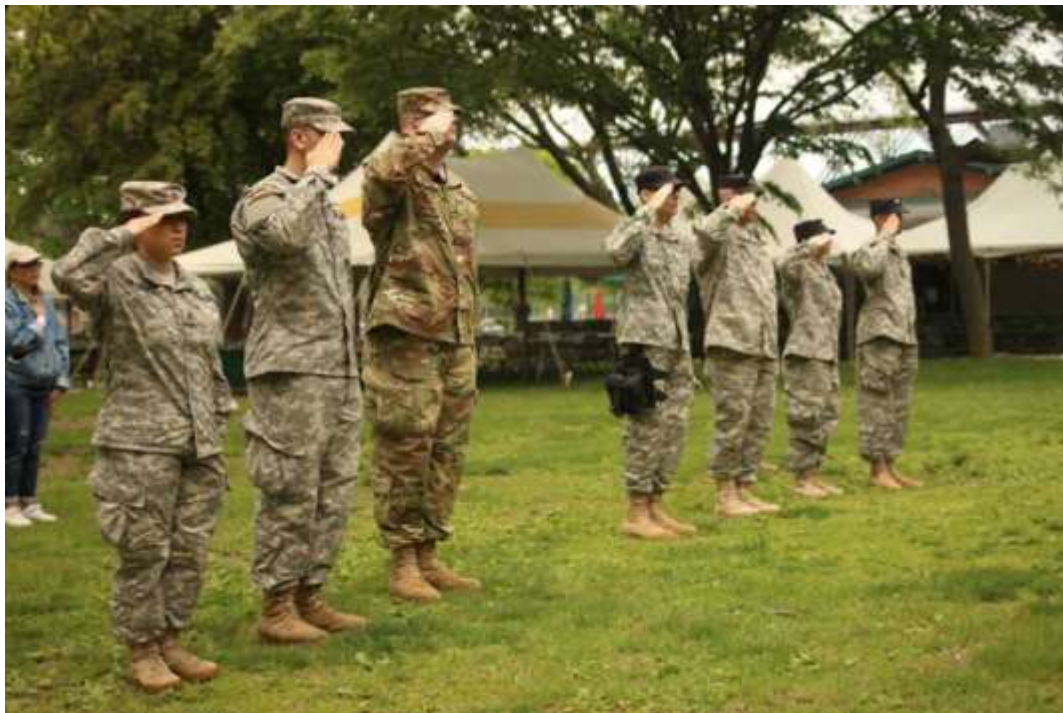
New York Guard soldiers and New York Army National Guard recruiters in formation during the National Anthem, on 20 May 2017 in Poughkeepsie, NY.