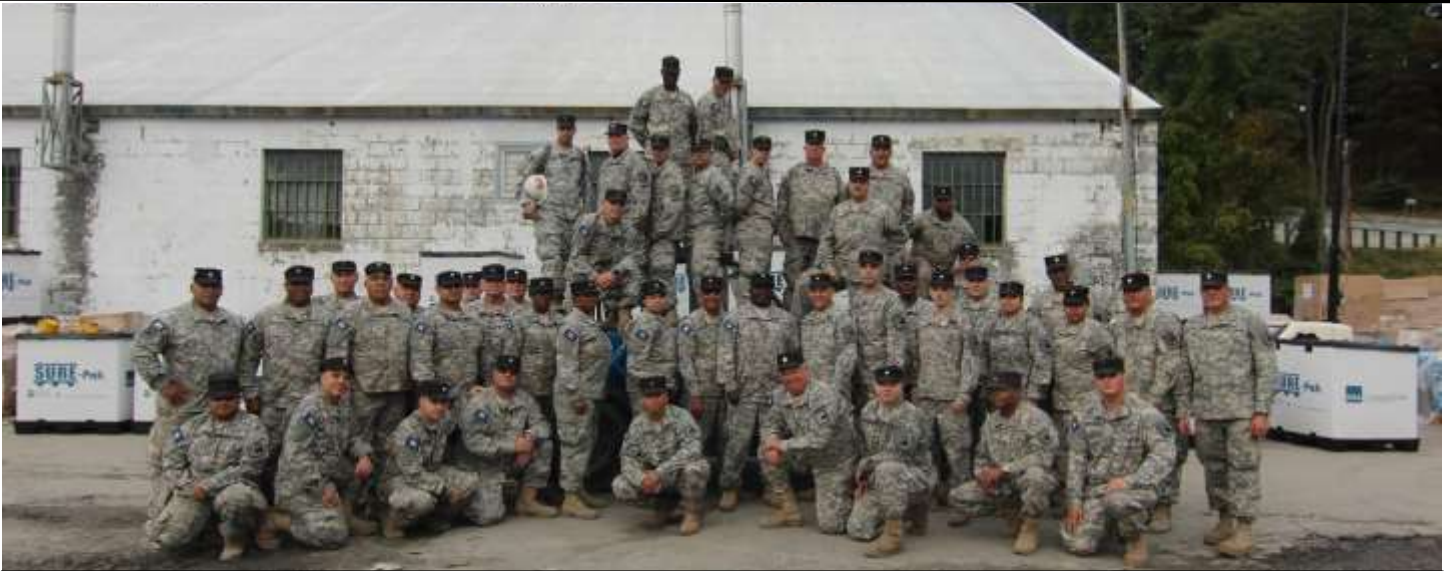
New York Guard soldiers on State Active Duty in support of Hurricane Maria relief efforts pose for a group photo at Camp Smith during a warehouse shift change. To date, more than 75 New York Guard soldiers have served on this extended activation alongside the New York Army National Guard and New York Naval Militia.