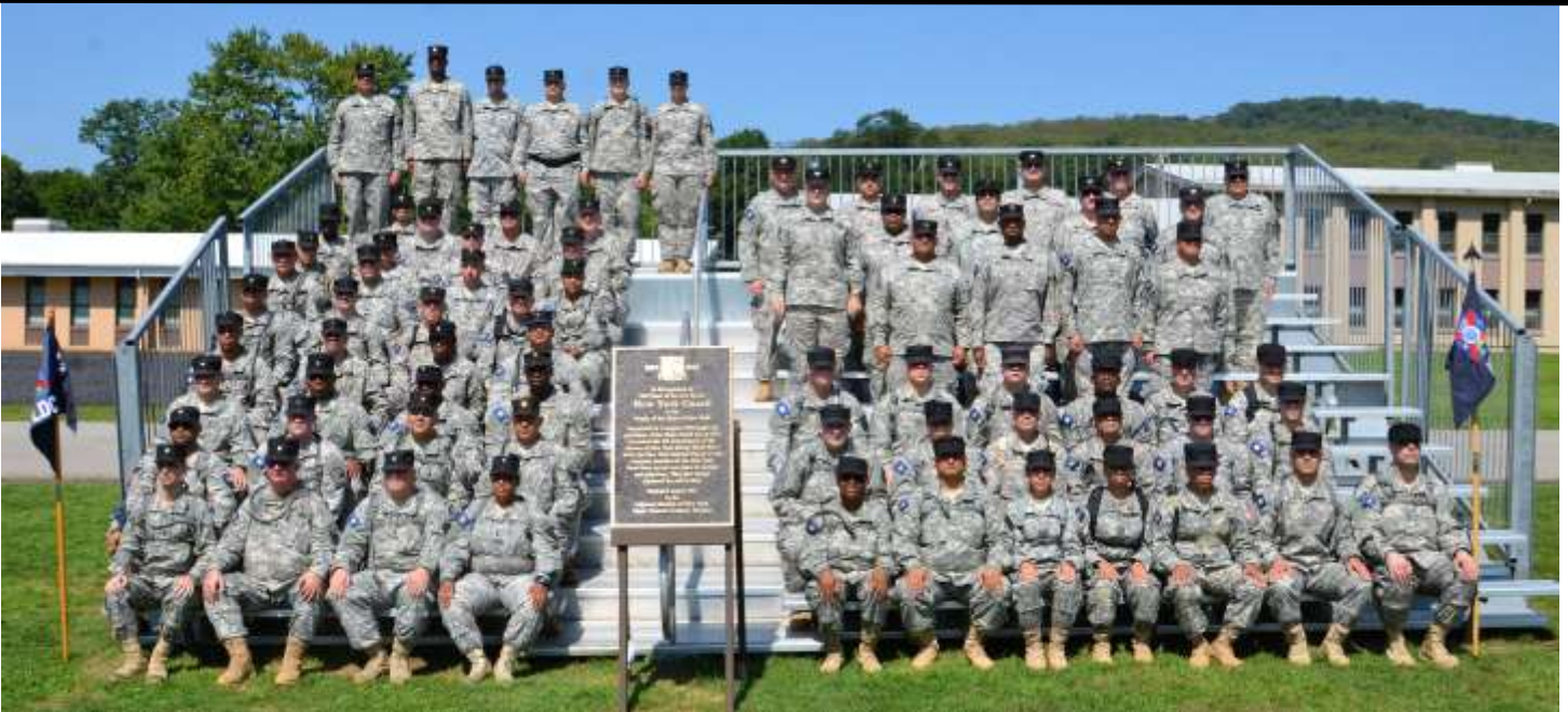
The New York Guard graduates of Primary Leadership Development Course (PLDC) 2017-01 and Initial Entry Training (IET) 2017-01 pose for a graduation photo with 12th RTI Cadre and Headquarters Staff."

zens, with 9/11, Hurricane Sandy in 2012 and most recently this summer assisting with filling sand bags and providing assistance to the National Guard, where needed with the flooding upstate in Lake Ontario. I appreciate all you do for New York State and its Citizens."