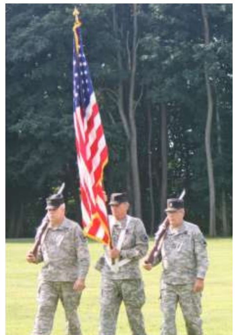
Color Guard members take to the parade field to rehearse for the Centennial Celebration during Annual Training 2017.