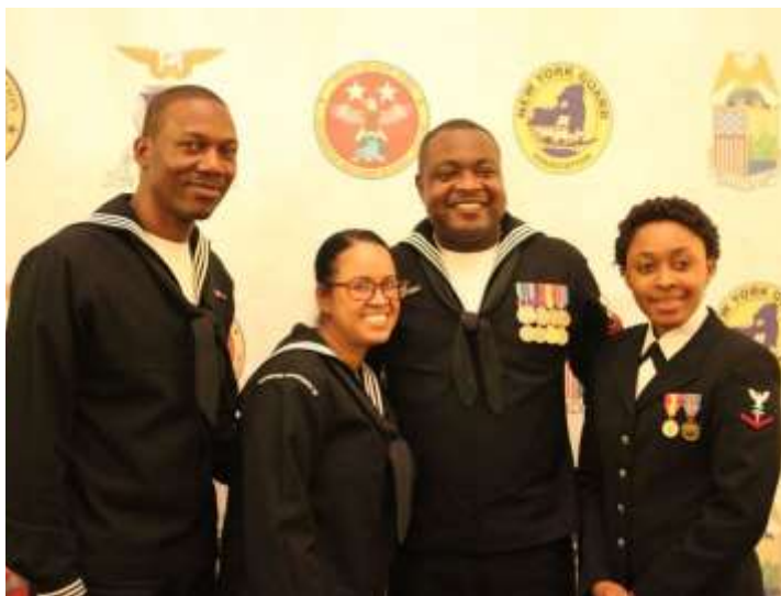
Sailors of the New York Naval Militia pose for photos at the Centennial Ball.