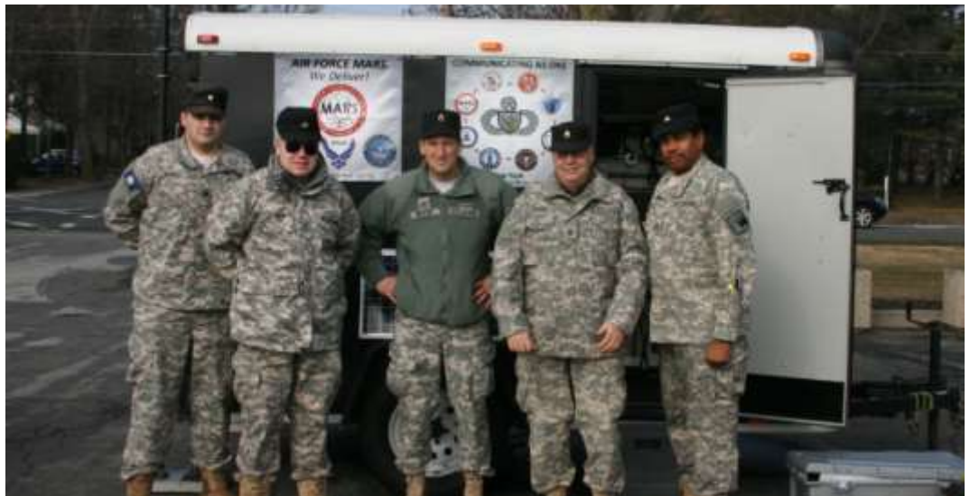
Soldiers of the 88AC Commo Team pose for a photo by their mobile communications trailer after a successful MERNEX.

The Military Emergency Radio Network (MERN) was established to provide the ability for New York Guard units to communicate effectively during disaster response and its assigned missions. The Military Auxiliary Radio System (MARS), which is a program operated jointly by the United States Army and United States Air Force with a mission objective to assist, and provide local, national and