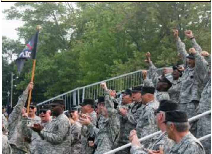
Soldiers of PLDC Class 2017-01 celebrate a victory during the Drill Down at Annual Training 2017.