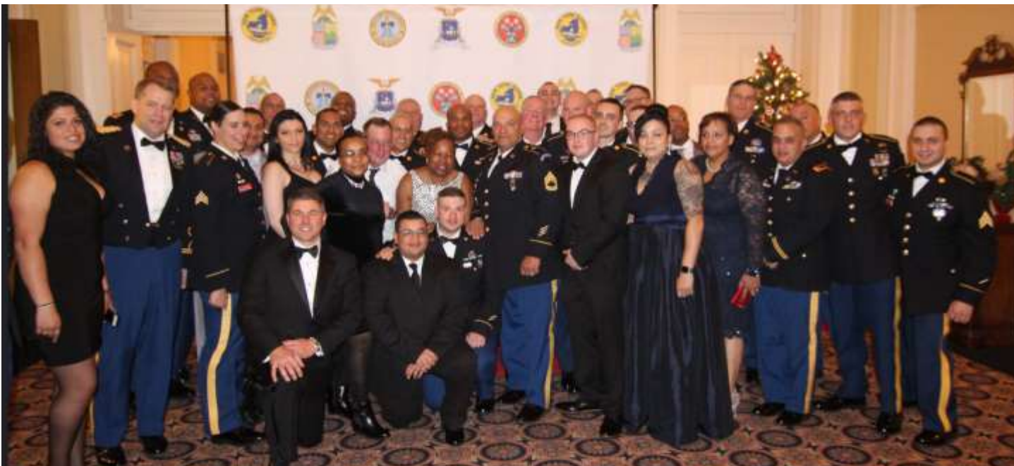
The New York Guard, together, at the New York Guard and the New York Naval Militia Annual Holiday Ball at West Point.