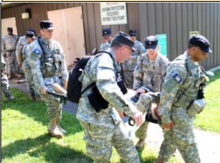
Soldiers of PLDC Class 2017-01 conduct a Mass Casualty Exercise during their FTX at Annual Training 2017.