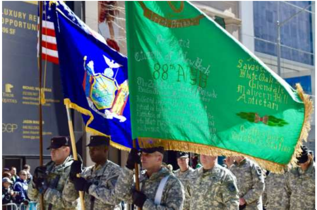
Soldiers of the 88th Brigade and other New York Guard units march in Manhattan on 17 March.

As the 88th came to a halt before St. Patrick's Cathedral, the Commander and his Brigade staff broke formation to pay their respects to Cardinal Dolan and the clergy. Having done so, the officers rejoined the Brigade which continued its march up the avenue behind the battle flag of their historical forebears, the 88th Regiment, or the 2nd Regiment of the Irish Brigade. The raucous crowd seemed to recognize the old regimental standard as it passed them and thus increased their cheers of approval in both volume and number. The effect of the