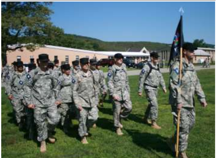
Soldiers of IET Class 2017-01 march onto the Parade Field during graduation at Annual Training 2017.