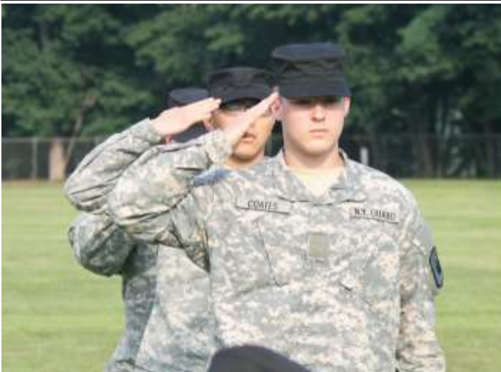
Soldiers of IET Class 2017-01 conduct D&C during the Drill Down competition at Annual Training 2017.