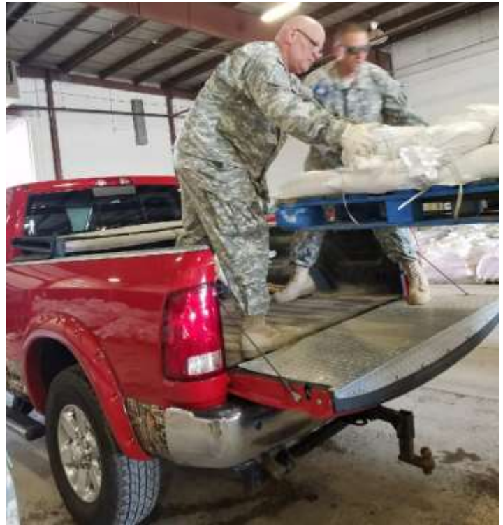
Right: New York Guard Soldiers load sandbags into a truck to be transported to flooded areas.

At the peak of operations, which began on May 3, just over 300 New York National Guard, Naval Militia, and New York Guard personnel have been involved in the flood response mission.