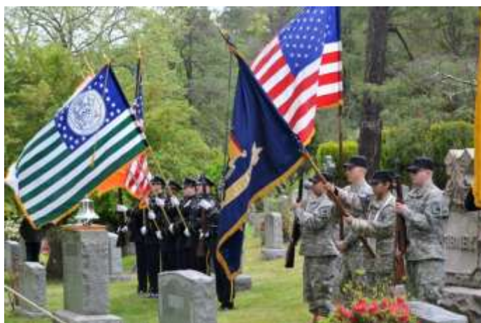
Color Guards from the NYC DEP Police (left) and the New York Guard (right) at Sleepy Hollow Cemetery, on 7 May 2017.