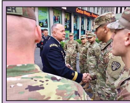
Army Guard Director Meets Empire Shield