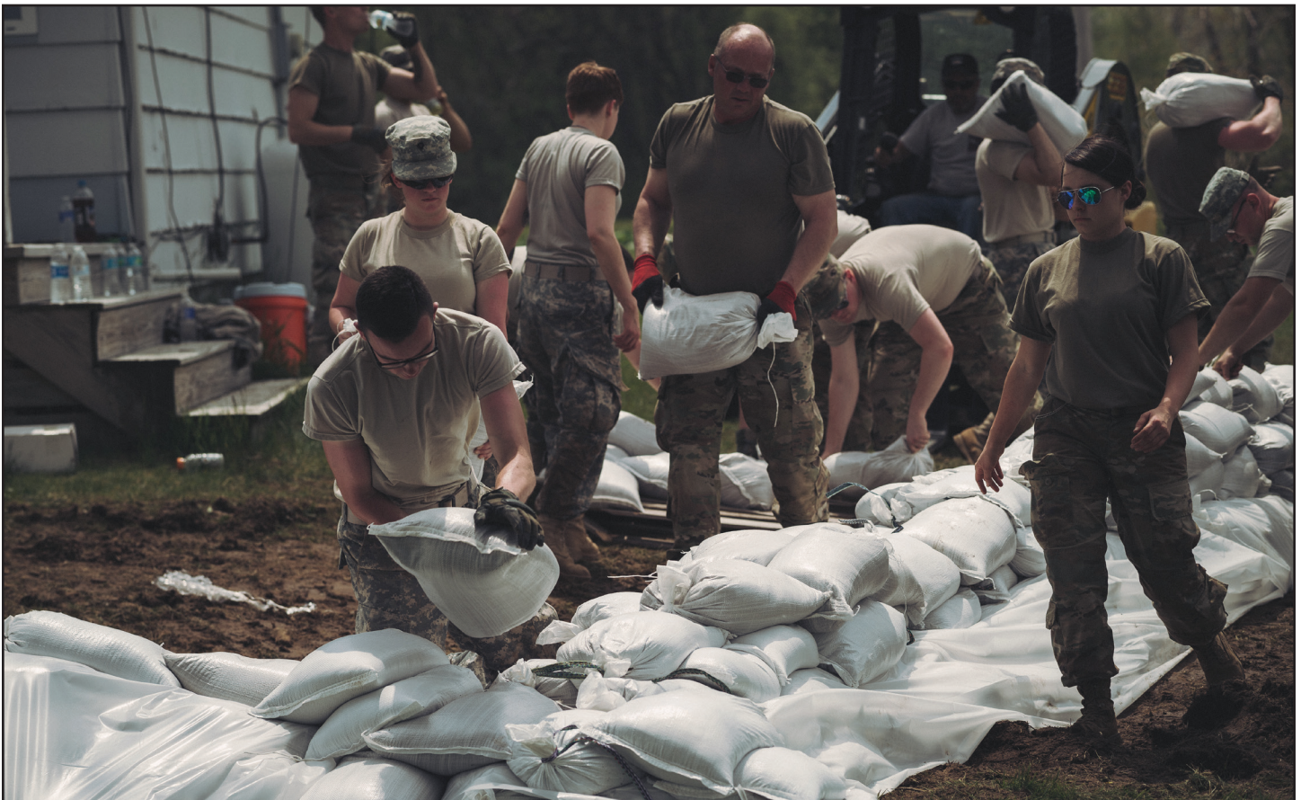
New York Army National Guard Soldiers emplace sandbag barriers along the Lake Ontario shoreline in Kendall, N.Y., on May 18 after rising water levels resulted in flooding and a state of emergency declared May 2 by Gov. Andrew Cuomo.