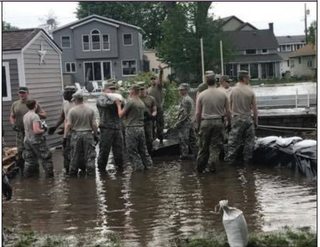
New York Army National Guard 105th Military Police Company Soldiers construct a sandbag barrier to protect property at Sodus Point, N.Y. from flooding due to rising waters on Lake Ontario on May 22.

Soldiers from the Army National Guard’s 642nd Aviation Support Battalion, the 105th Military Police Company, the 27th Infantry Brigade Combat Team and 427th Forward Support Battalion have supported the mission, along with members of the New York Air National Guard’s 107th Attack Wing and 174th Attack Wing. gt