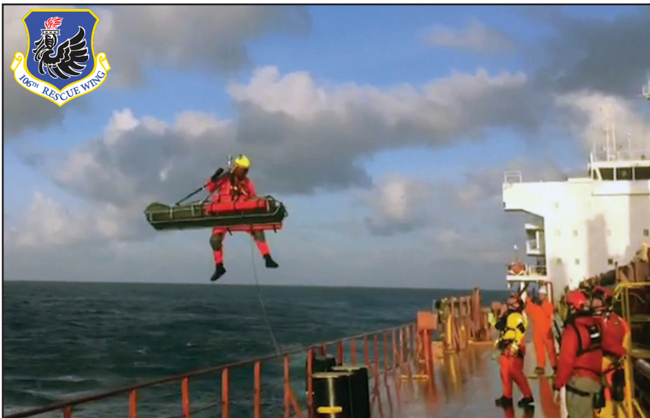
An airman from Esquadra 751, the Portuguese Air Force search and rescue organization, accompanies a litter carrying one of the injured Tamar crewman off the ship onto a hovering Merlin helicopter April 27, in the Atlantic Ocean after he and another badly burned sailor had been treated by members of the New York Air National Guard's 106th Rescue Wing for the past three days.

The HC-130 crew dropped two Zodiac boats into the water.