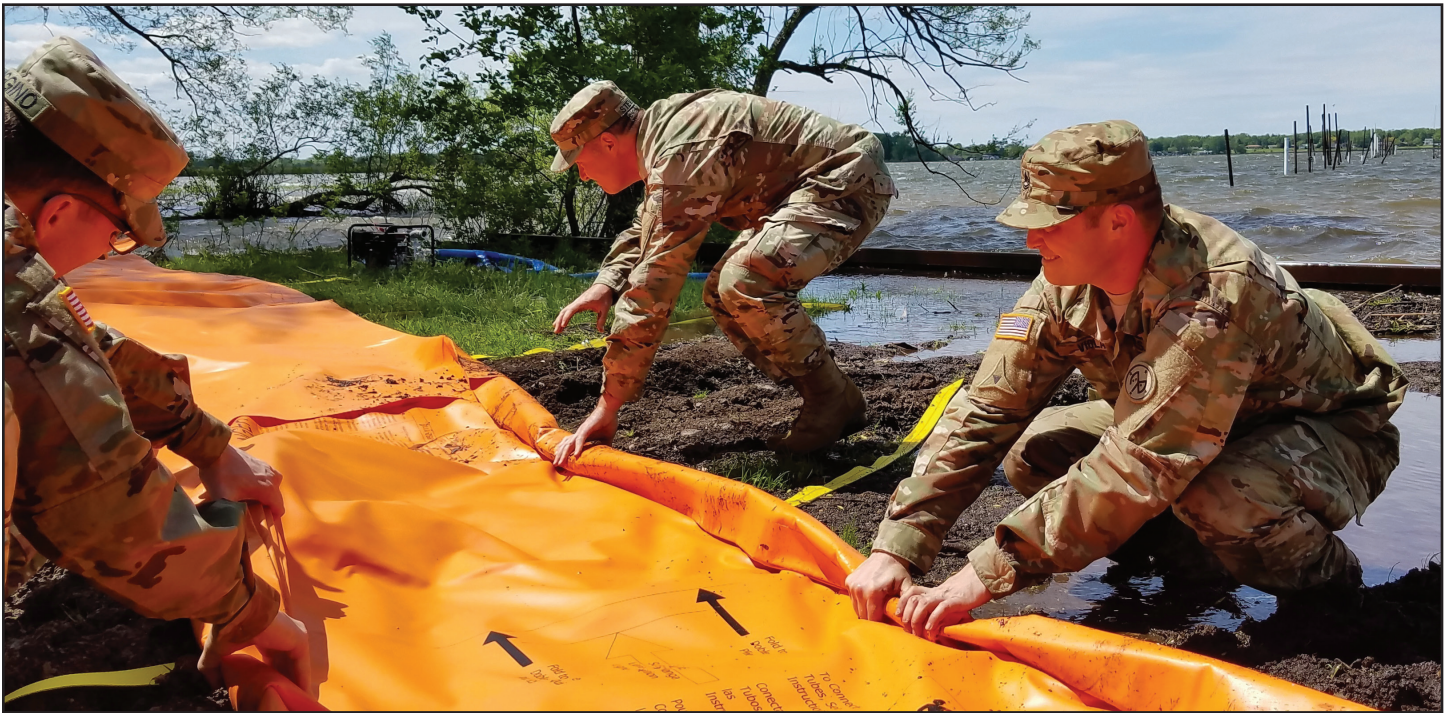
New York Army National Guard Soldiers deploy the Tiger Dam flood control system along the shores of Braddock Bay in the Town of Greece, N.Y. in response to rising waters on Lake Ontario. The system consists of flexible fabric tubes which are connected and filled with water. The tubes replace sandbags as a flood control mechanism.

Works. “We have also had teams going out into the field and building break walls.”