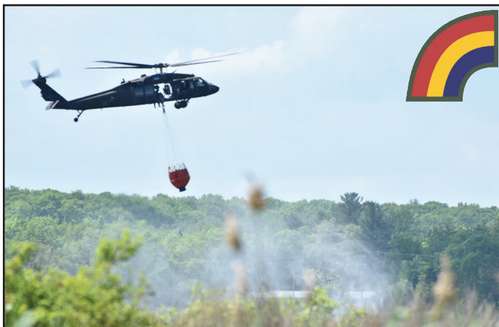
New York Army National Guard aircrew from the 3rd Battalion, 142nd Aviation prepare to fill a Bambi Bucket with water from Round Lake, N.Y., May 31, 2017. The aviators were conducting a slow pick-up in order to fill their bucket with as much water as possible.