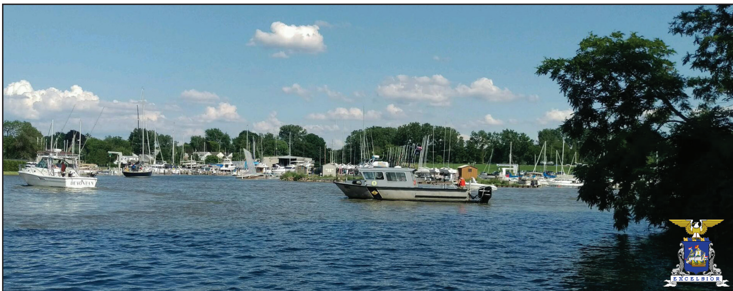
GREECE, N.Y. -- New York Naval Militia Patrol Boat 280 heads out onto Lake Ontario on a presence patrol here July 2, 2017. Two boats and crews were dispatched to make pleasure boaters aware that they should reduce speeds in areas adjacent to the shore line to prevent flooding. See our related story on page 12.