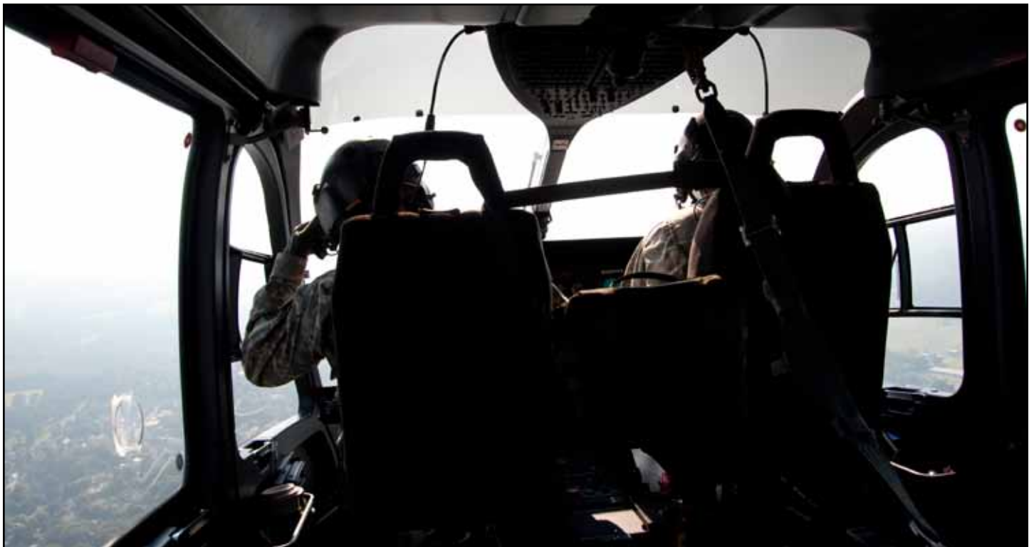
Counterdrug aviation Soldiers fly a UH-72A Lakota on a search for marijuana plants. A Rensselaer County law enforcement agent is also on board. If found, the marijuana is either marked for eradication at a later time, or ground support is called in to destroy it.

"They really appreciate us coming out to aid in their role to keep their counties clean," said the pilot. "We're helping them keep drugs off the street and out of schools, and they love when we are able to come out. It's a very good relationship." gt