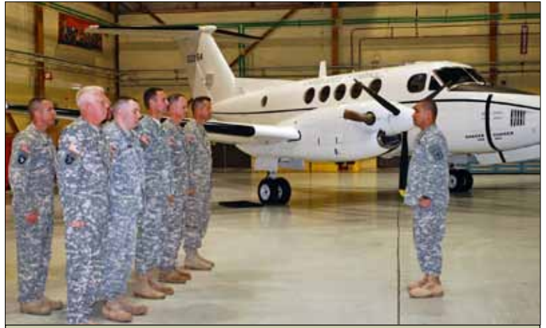
Soldiers of the New York Army National Guard's Detachment 20, Operation Support Airlift Agency stand in formation during their deployment ceremony on Oct. 25.

The C-12 is the military version of the Beechcraft Super King Air turboprop aircraft, capable of carrying up to 13 passengers, depending on the model and configuration.