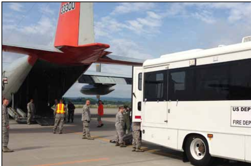
Civilian agencies, such as the Department of Veterans Affairs, partnered with airmen from the 109th Airlift Wing during the exercise, which was designed to practice patient movement, treatment, and distribution to local hospitals for treatment.

Stratton Air National Guard Base acts as a federal coordinating center to recruit hospitals and maintain local non-federal hospital participation in the NDMS; coordinate exercise development and emergency plans with participating hospitals and other local authorities in order to develop patient reception, transportation, and communication plans; and during system activation, coordinate the reception and distribution of patients being evacuated to the area.