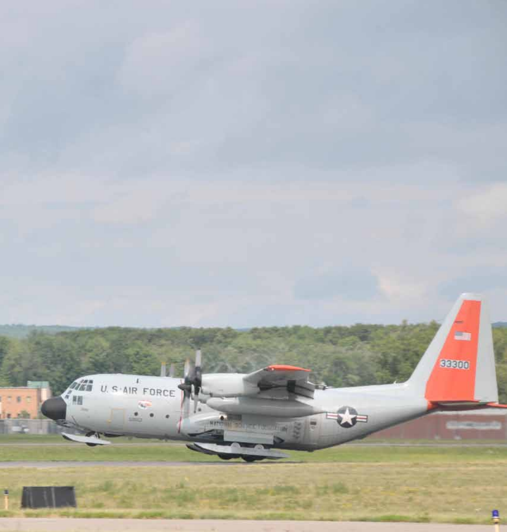
An LC-130 aircraft takes off after being loaded with simulated patients as part of a National Defense Management System Exercise held at Stratton Air National Guard Base in August.