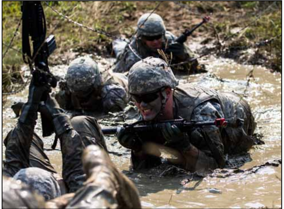
42nd CAB troops crawl under concertina wire during pre-mobilization training in August.