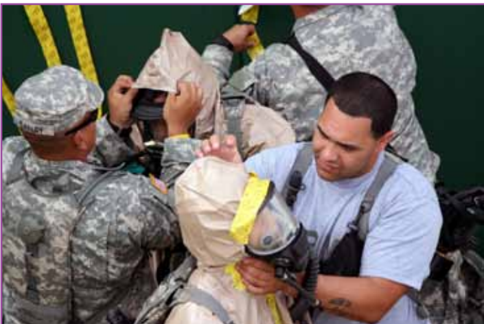
CBRN enterprise troops prepare their team members for duties on the decontamination line during the disaster-response exercise.