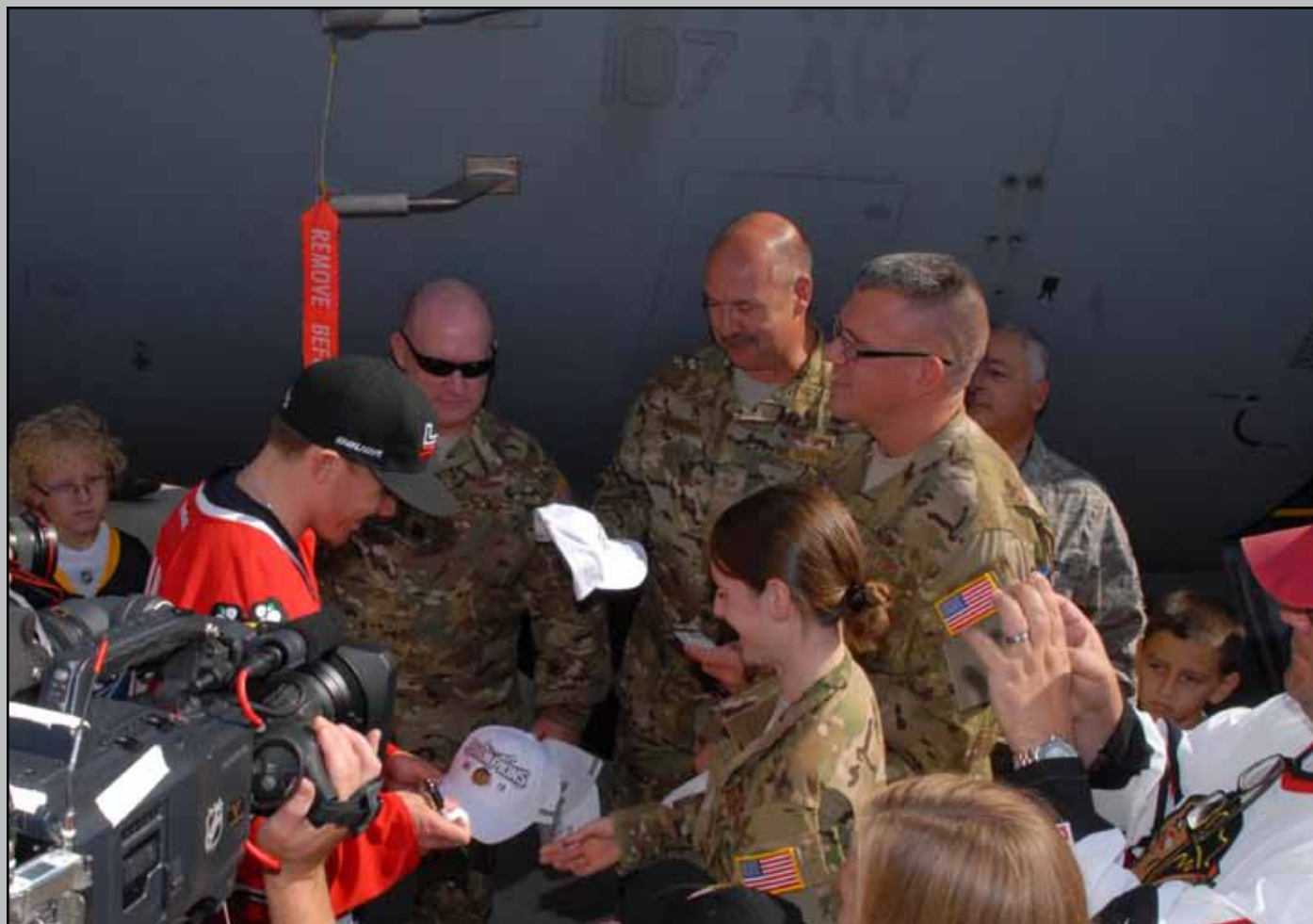
Chicago Blackhawks right wing Patrick Kane autographs a hat during his visit at Niagara Falls Air Reserve Station in August.

Kane and the Blackhawks won the Stanley Cup in June when they defeated the Boston Bruins for the National Hockey League championship. Kane earned the Conn Smythe Trophy, which is awarded to the most valuable player of the NHL's Stanley Cup Playoffs. gt