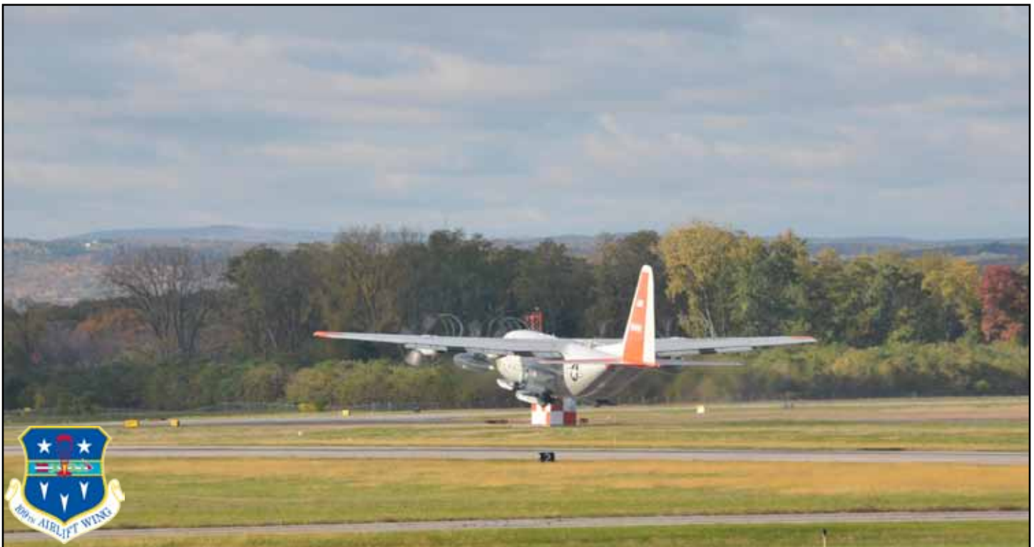
An LC-130 aircraft, bound for Antarctica in support of Operation Deep Freeze, takes off from Stratton Air National Guard Base Oct. 18.

In 2008, another 109th LC-130 rescued an Australian researcher who had broken his leg in an accident and flew him to Hobart, Australia from Antarctica. gt.