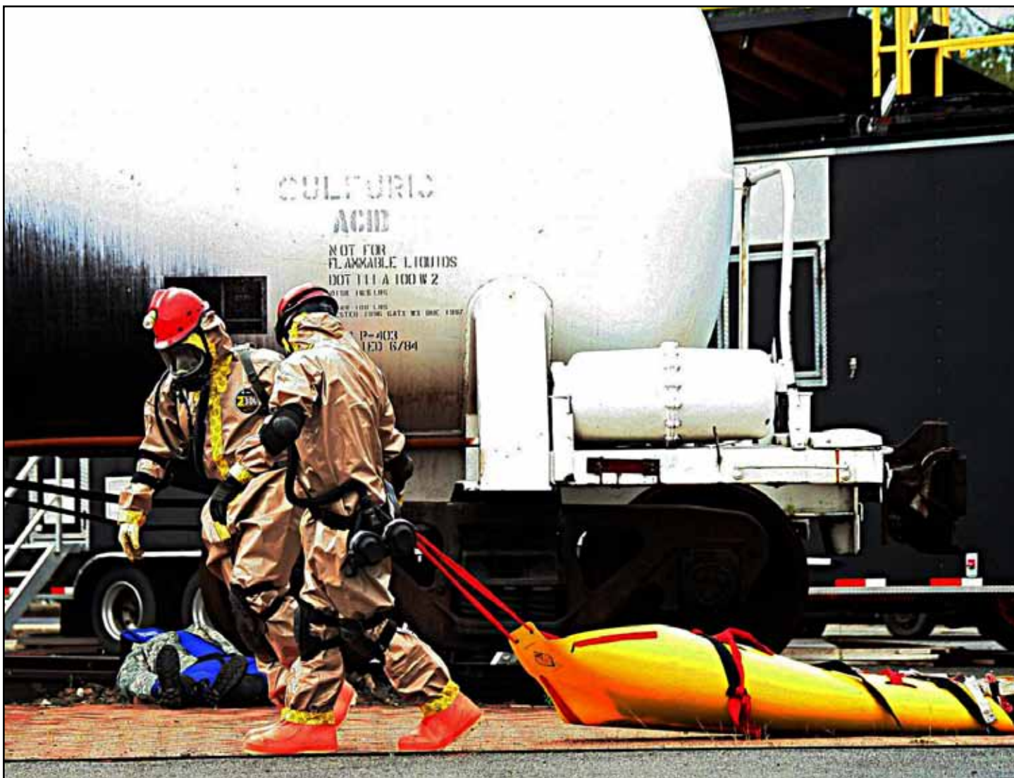
Soldiers from the search and extraction element of the CBRN enterprise evacuate a simulated casualty during the disaster-response exercise.

The team trains under Defense Department guidelines to respond within a 6-12 hour window to local authorities after a CBRNE or other hazardous materials incident requiring assistance from federal military resources. gt