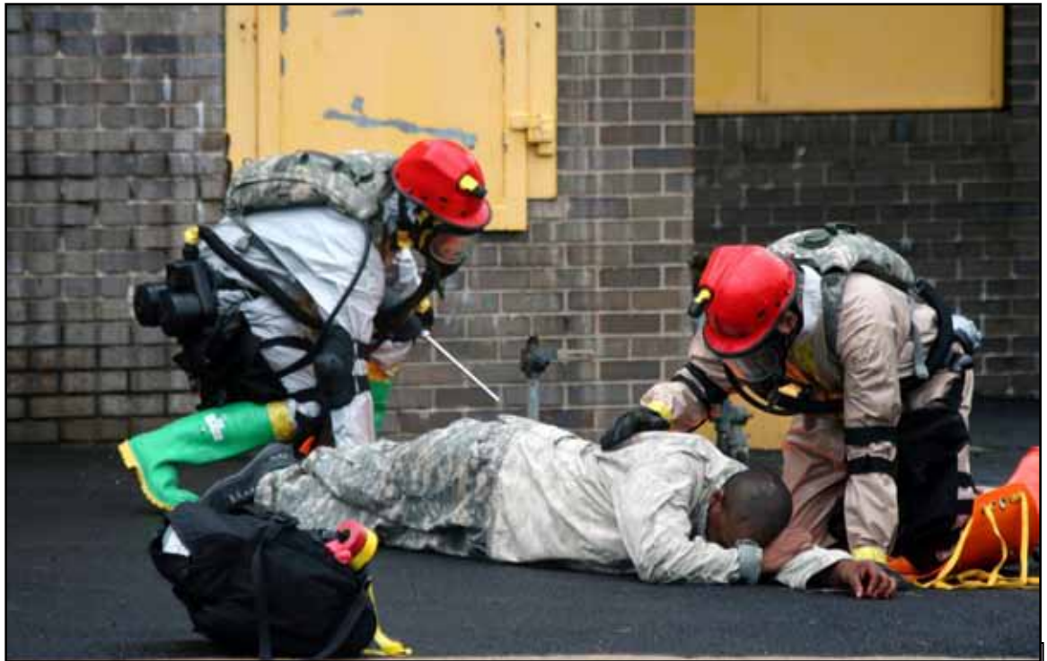
New York Army National Guard Soldiers from the search and extraction element of the Chemical, Biological, Radiological and Nuclear (CBRN) enterprise evaluate a simulated casualty during a disaster-response exercise at the Westchester County Fire Training Center, Valhalla in August.

The HRF consists of troops with expertise in the search and extraction of disaster victims, incident site security, decontamination, medical