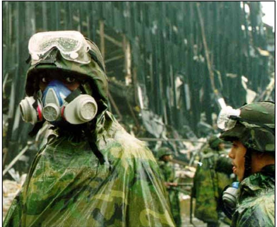
A New York Army National Guard Soldier from Co. C, 1st Bn., 105th Infantry helps provide security at Ground Zero Sep. 14, 2001 as part of the Guard response to 9/11.

Troops assisted with initial rescue efforts, security for first responders and law enforcement and provided additional expertise for logistics, security administration and recovery support. It was the single largest response mission