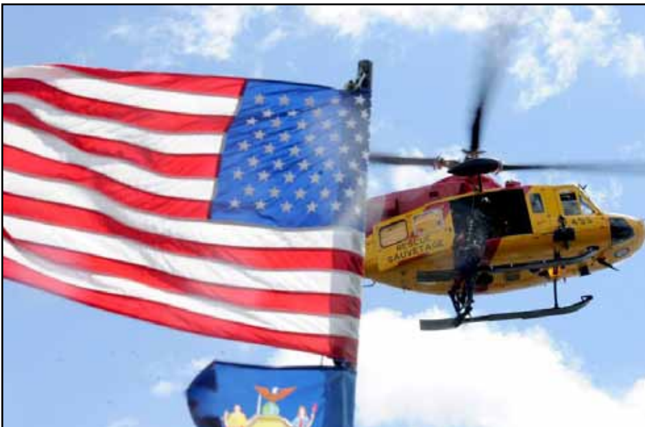
Royal Canadian Air Force Search-and-Rescue technicians are hoisted back aboard a CH-146 Griffon helicopter during a joint-training exercise hosted by the New York Air National Guard's 174th Attack Wing in August.

"The addition of the Canadian forces was a unique opportunity to further blend otherwise disparate units into a single mission-cohesive force," Cox said. "We have proven that the MQ-9 is an enormously valuable tool in support of maritime forces. Training like this demonstrates the evolving and indispensable role of Air Force JTACs and remotely-piloted aircraft across a broad spectrum of joint operations, from tactical operations to civil support operations." gt