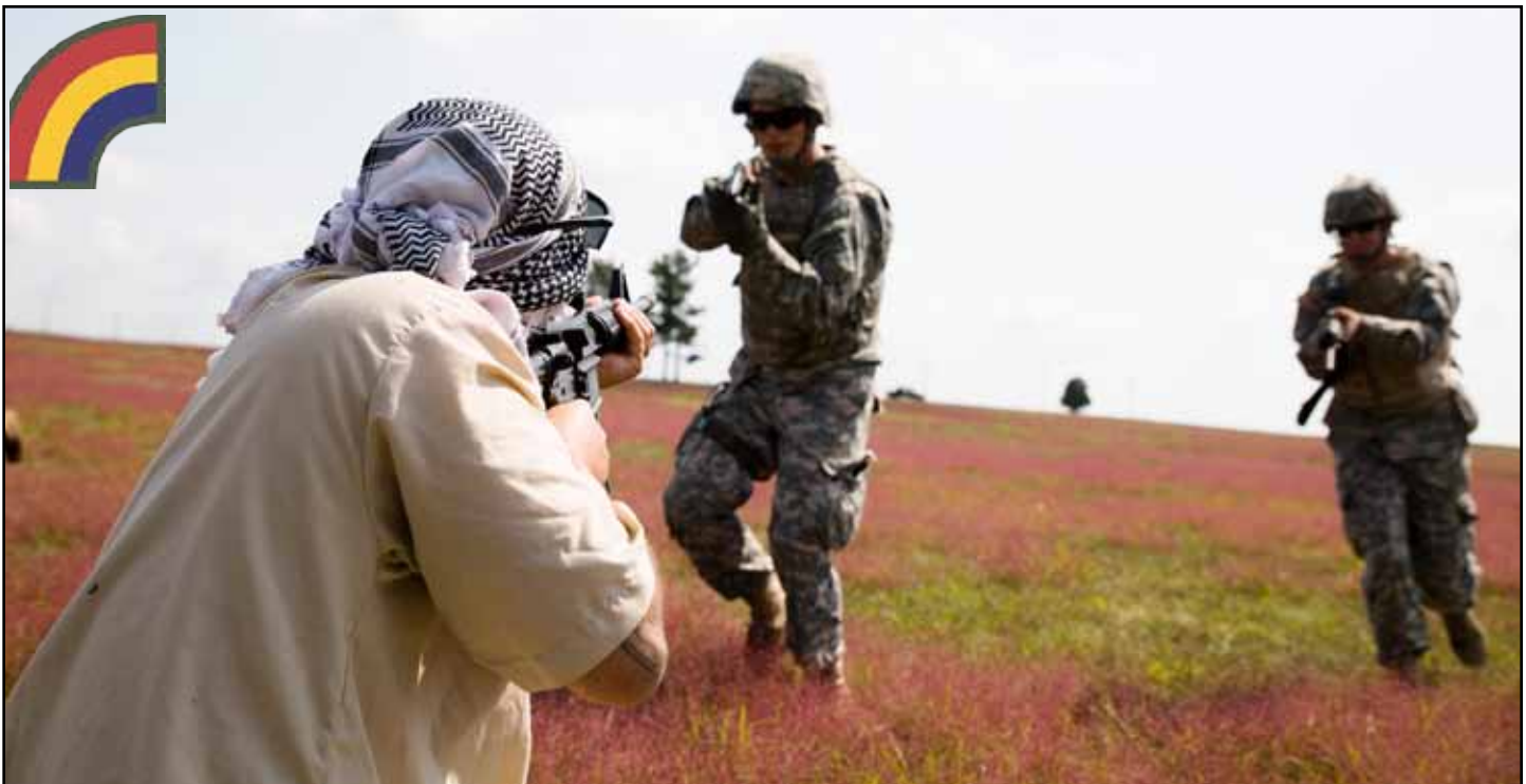
42nd CAB Soldiers assault a mock insurgent position during pre-mobilization training.

"Stay hydrated," he said with a smile. "Stay active. Don't get bored, you'll get in trouble. gt