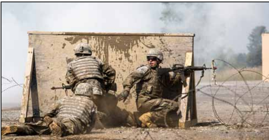
42nd CAB troops conduct dismounted exercises during pre-mobilization training.

These young troops will have the chance to grow during the deployment, Ricci said. "That