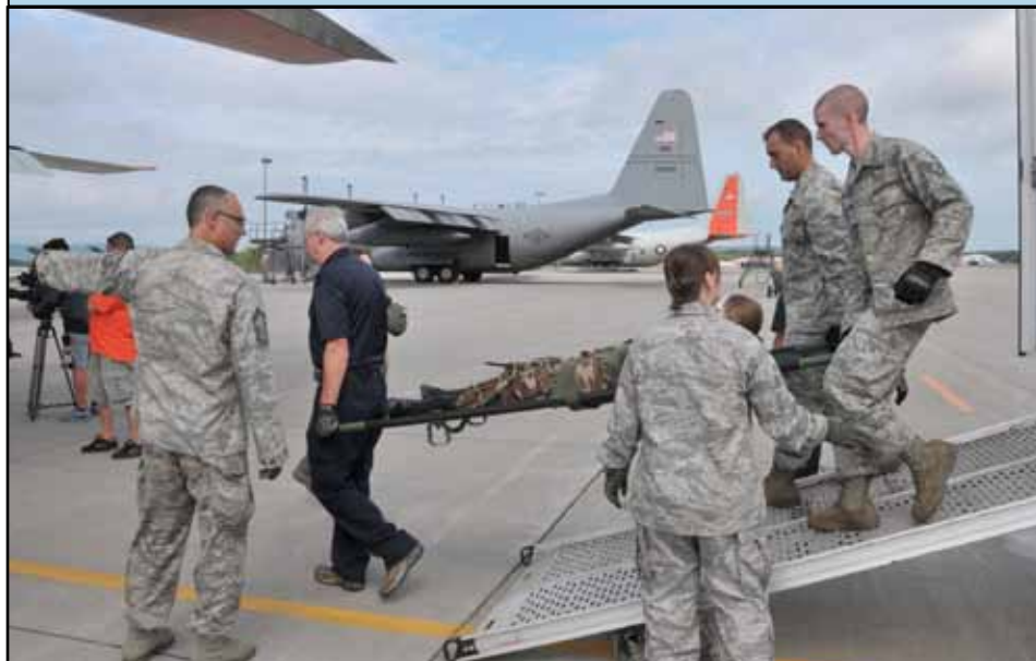
Airmen of the 139th Aeromedical Evacuation Squadron, 109th Airlift Wing work alongside civilian agencies to carry a simulated patient, to an LC-130 aircraft during the exercise.

The airmen of the 109th AW have responded to a number of state emergencies, including Tropical Storm Irene in 2011 and Superstorm Sandy in 2012. In addition to supporting the