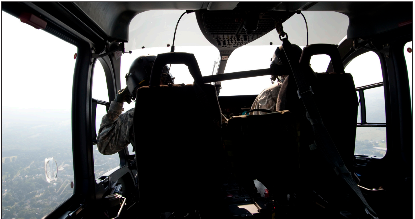
Counterdrug aviation Soldiers fly a UH-72A Lakota on a search for marijuana plants. A Rensselaer County law enforcement agent is also on board. If found, the marijuana is either marked for eradication at a later time, or ground support is called in to destroy it.

"They really appreciate us coming out to aid in their role to keep their counties clean," said the pilot. "We're helping them keep drugs off the street and out of schools, and they love when we are able to come out. It's a very good relationship." gt