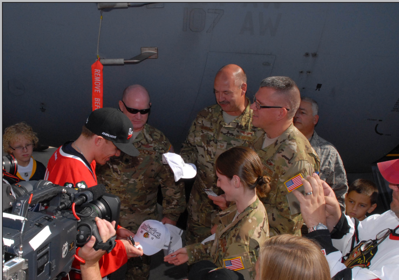
Chicago Blackhawks right wing Patrick Kane autographs a hat during his visit at Niagara Falls Air Reserve Station in August.

Kane and the Blackhawks won the Stanley Cup in June when they defeated the Boston Bruins for the National Hockey League championship. Kane earned the Conn Smythe Trophy, which is awarded to the most valuable player of the NHL's Stanley Cup Playoffs. gt