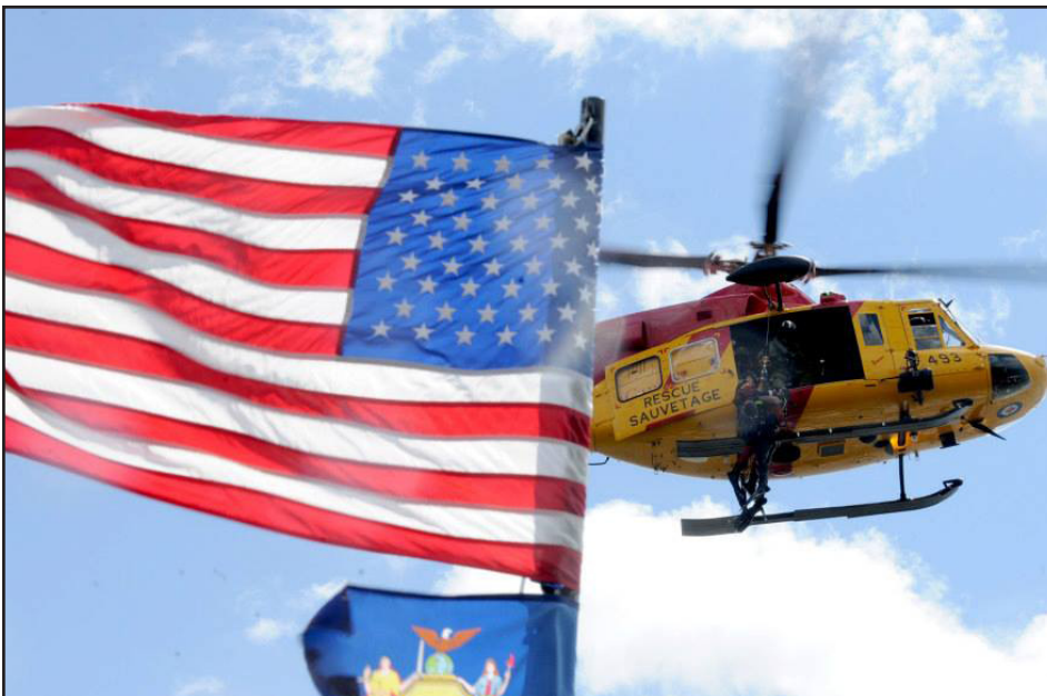
Royal Canadian Air Force Search-and-Rescue technicians are hoisted back aboard a CH-146 Griffon helicopter during a joint-training exercise hosted by the New York Air National Guard's 174th Attack Wing in August.

"The addition of the Canadian forces was a unique opportunity to further blend otherwise disparate units into a single mission-cohesive force," Cox said. "We have proven that the MQ-9 is an enormously valuable tool in support of maritime forces. Training like this demonstrates the evolving and indispensable role of Air Force JTACs and remotely-piloted aircraft across a broad spectrum of joint operations, from tactical operations to civil support operations."gt