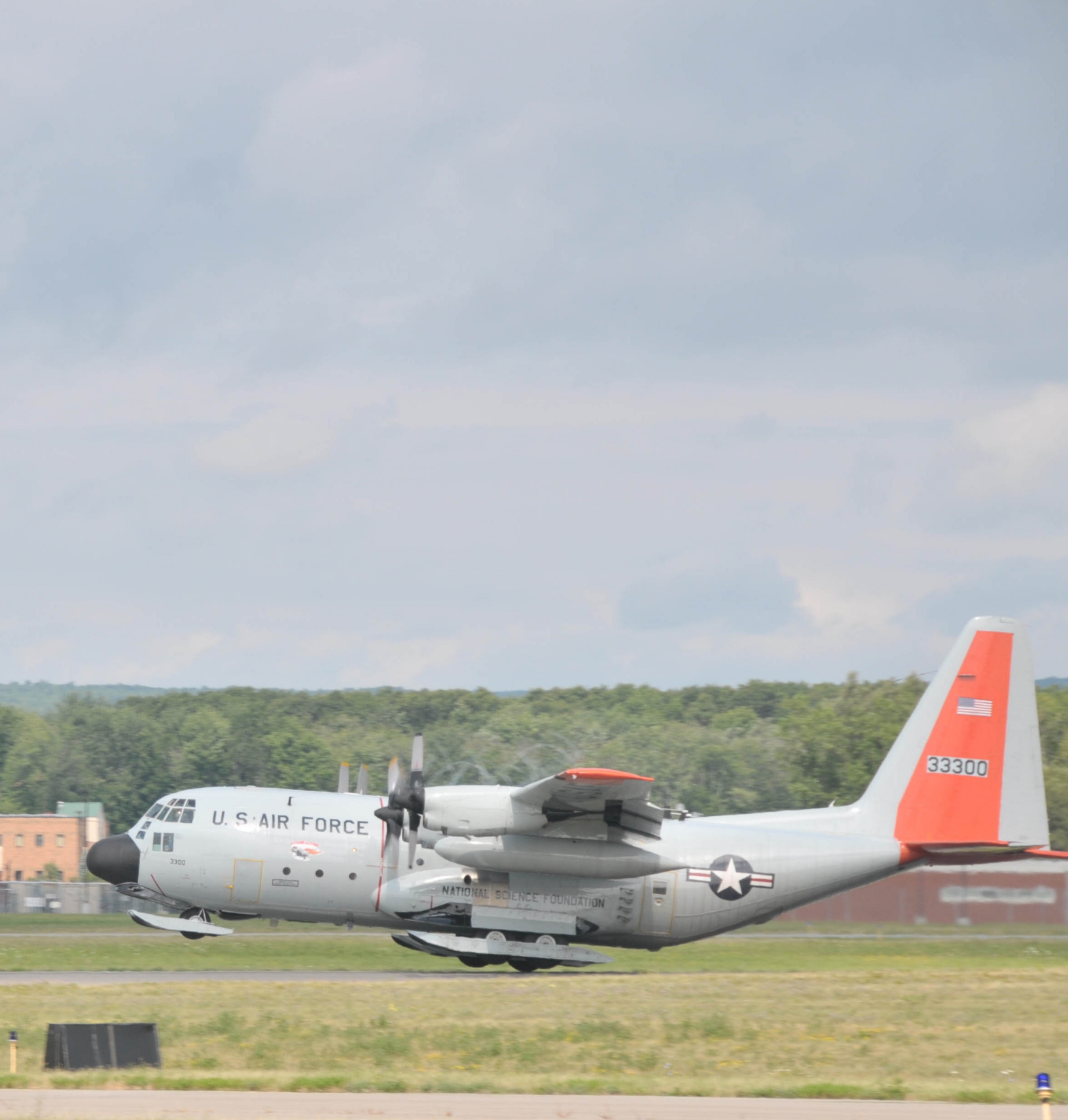
An LC-130 aircraft takes off after being loaded with simulated patients as part of a National Defense Management System Exercise held at Stratton Air National Guard Base in August.