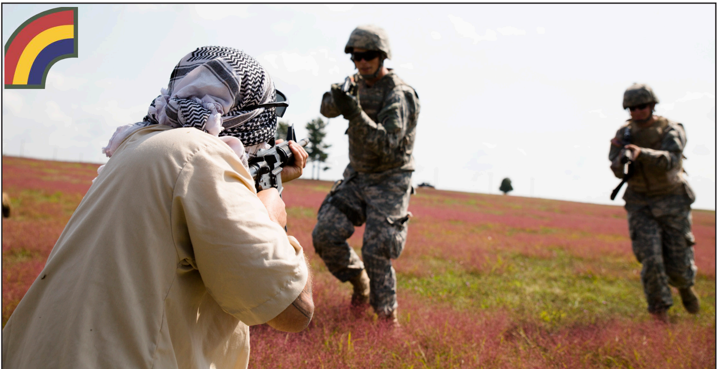
42nd CAB Soldiers assault a mock insurgent position during pre-mobilization training.

"Stay hydrated," he said with a smile. "Stay active. Don't get bored, you'll get in trouble. gt