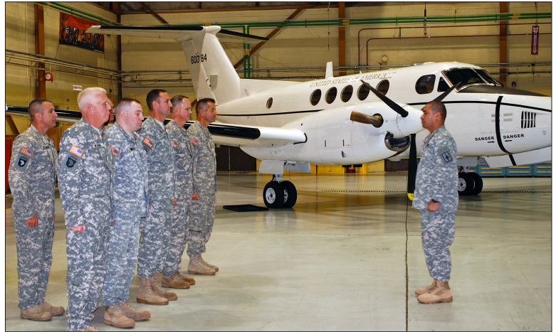
Soldiers of the New York Army National Guard's Detachment 20, Operation Support Airlift Agency stand in formation during their deployment ceremony on Oct. 25.

The C-12 is the military version of the Beechcraft Super King Air turboprop aircraft, capable of carrying up to 13 passengers, depending on the model and configuration.