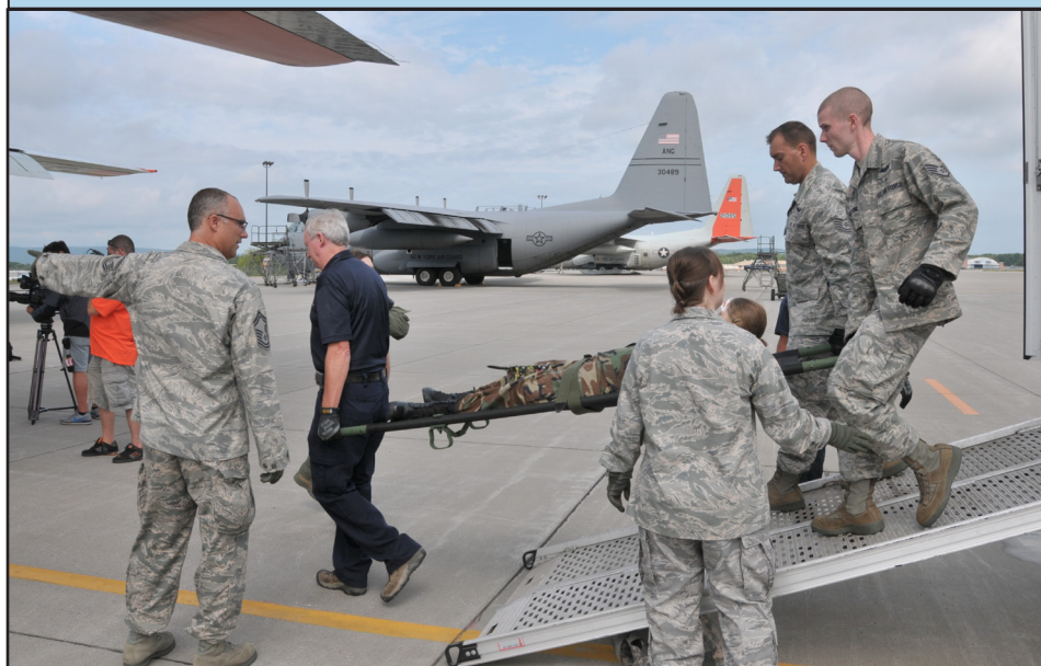
Airmen of the 139th Aeromedical Evacuation Squadron, 109th Airlift Wing work alongside civilian agencies to carry a simulated patient, to an LC-130 aircraft during the exercise.

The airmen of the 109th AW have responded to a number of state emergencies, including Tropical Storm Irene in 2011 and Superstorm Sandy in 2012. In addition to supporting the