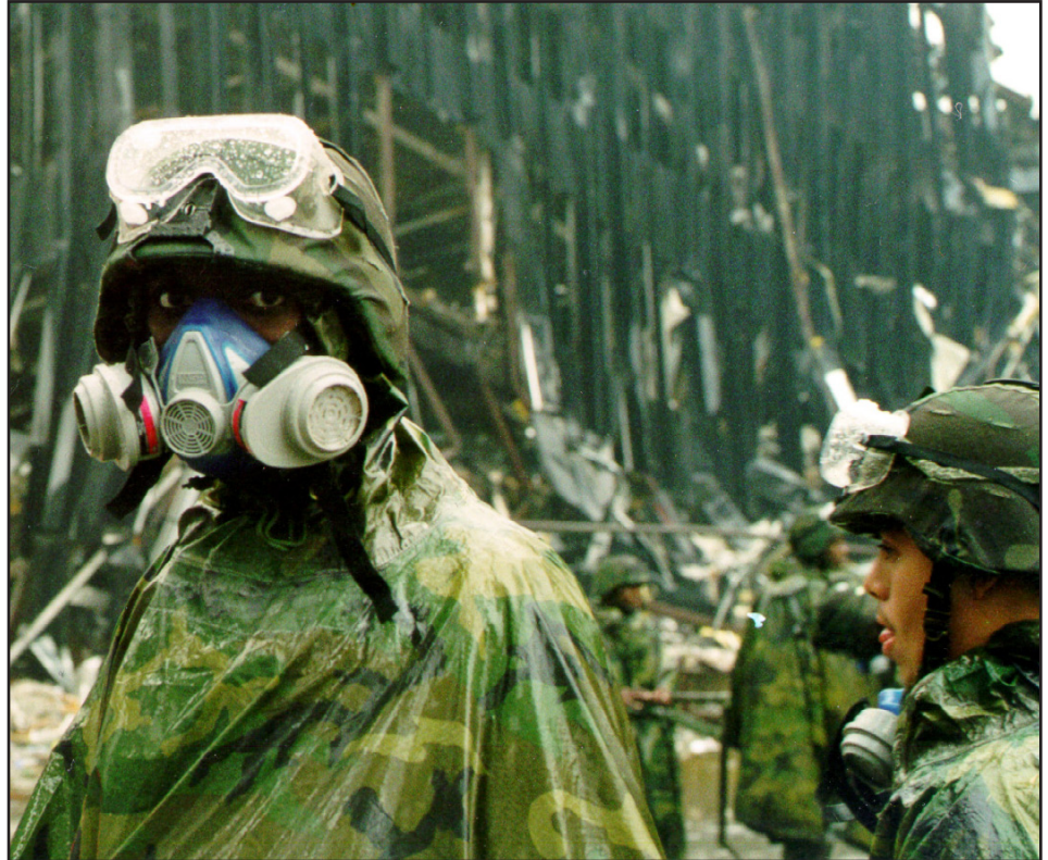
A New York Army National Guard Soldier from Co. C, 1st Bn., 105th Infantry helps provide security at Ground Zero Sep. 14, 2001 as part of the Guard response to 9/11.

Troops assisted with initial rescue efforts, security for first responders and law enforcement and provided additional expertise for logistics, security administration and recovery support. It was the single largest response mission