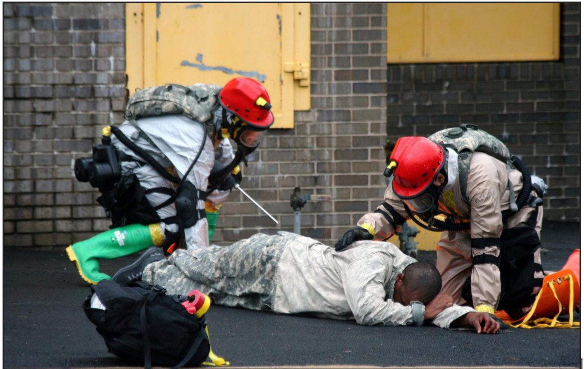
New York Army National Guard Soldiers from the search and extraction element of the Chemical, Biological, Radiological and Nuclear (CBRN) enterprise evaluate a simulated casualty during a disaster-response exercise at the Westchester County Fire Training Center, Valhalla in August.

The HRF consists of troops with expertise in the search and extraction of disaster victims, incident site security, decontamination, medical