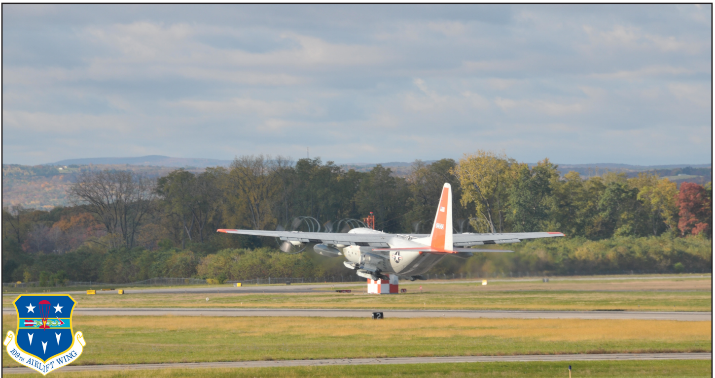
An LC-130 aircraft, bound for Antarctica in support of Operation Deep Freeze, takes off from Stratton Air National Guard Base Oct. 18.

In 2008, another 109th LC-130 rescued an Australian researcher who had broken his leg in an accident and flew him to Hobart, Australia from Antarctica. gt.