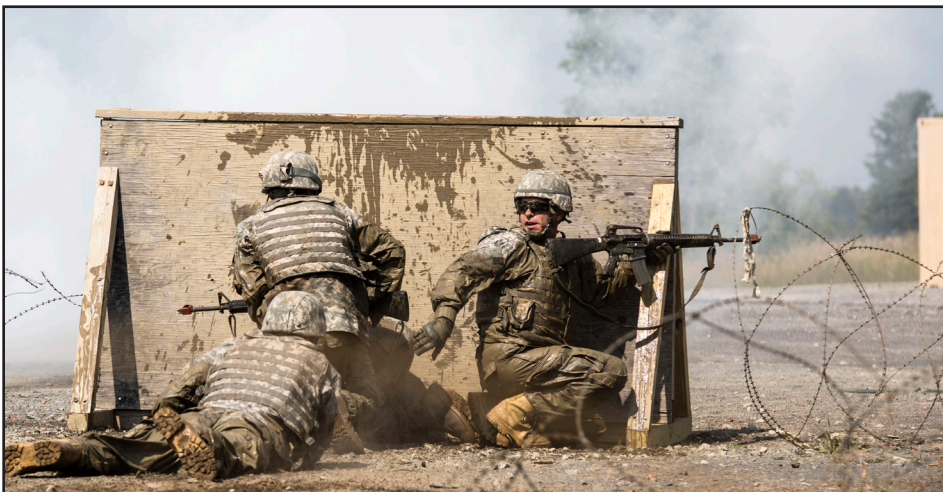
42nd CAB troops conduct dismounted exercises during pre-mobilization training.

These young troops will have the chance to grow during the deployment, Ricci said. "That