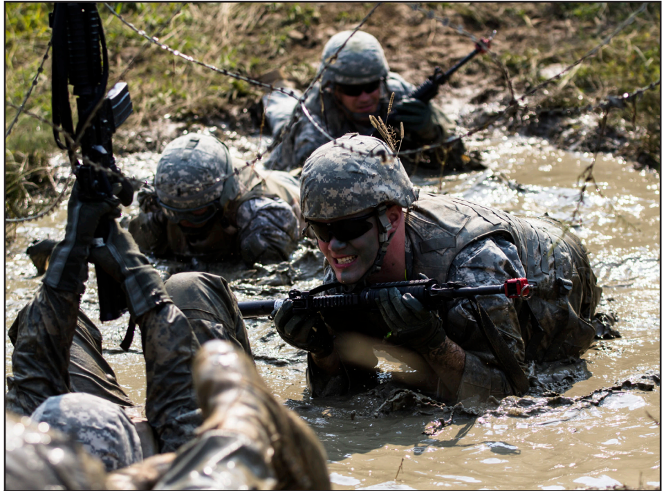
42nd CAB troops crawl under concertina wire during pre-mobilization training in August.