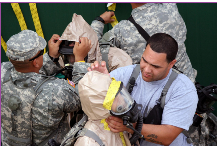
CBRN enterprise troops prepare their team members for duties on the decontamination line during the disaster-response exercise.