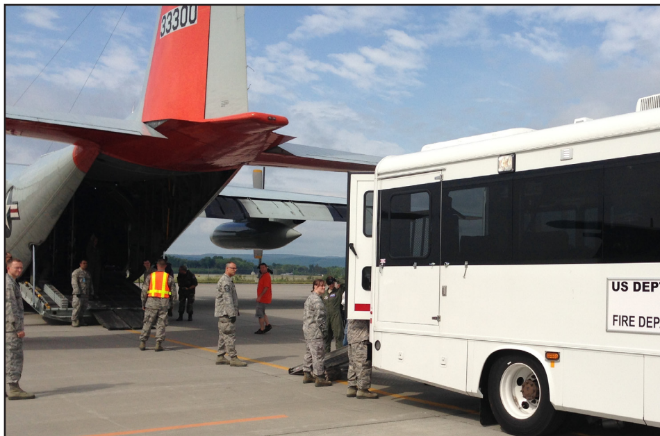
Civilian agencies, such as the Department of Veterans Affairs, partnered with airmen from the 109th Airlift Wing during the exercise, which was designed to practice patient movement, treatment, and distribution to local hospitals for treatment.

Stratton Air National Guard Base acts as a federal coordinating center to recruit hospitals and maintain local non-federal hospital participation in the NDMS; coordinate exercise development and emergency plans with participating hospitals and other local authorities in order to develop patient reception, transportation, and communication plans; and during system activation, coordinate the reception and distribution of patients being evacuated to the area.