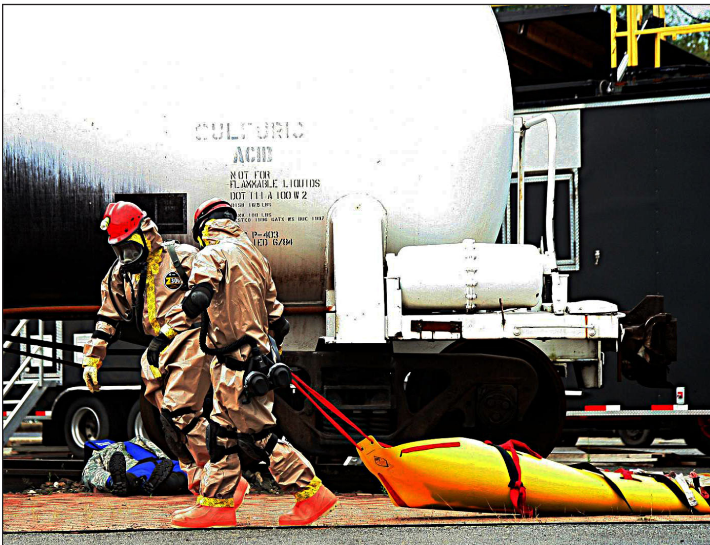
Soldiers from the search and extraction element of the CBRN enterprise evacuate a simulated casualty during the disaster-response exercise.

The team trains under Defense Department guidelines to respond within a 6-12 hour window to local authorities after a CBRNE or other hazardous materials incident requiring assistance from federal military resources. gt