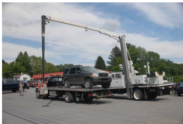
MVACIS operators perform a scan for a local LEA.

The MVACIS inspection system provides substantial flexibility to assist with a variety of security missions including contraband interdiction (i.e. narcotics, weapons, and cash). Mobile scanners use gamma rays as opposed to x-rays, allowing lower equipment cost, smaller operating space, higher reliability, availability, and safer operation.