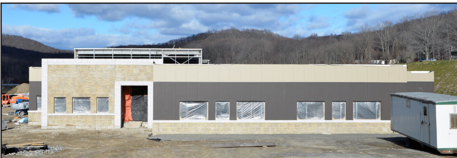
Construction of the new Combined Support Maintenance Shop at Camp Smith Training Site continues. The new facility, due to be completed in 2017, will provide support to units on Long Island and in New York City and the Hudson Valley.

Work on the project is expected to be finished in June 2017.