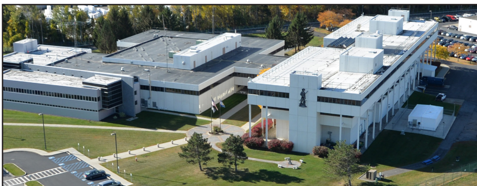
The New York State Division of Military and Naval Affairs headquarters is located in Latham, N. Y.

DMNA is responsible for maintaining New York's collection of more than 10,000 historically significant military items ranging from Civil War Battle Flags to historic uniforms and items displayed in armories across New York. The New York State Military Museum and Veterans Research Center in Saratoga Springs is administered by DMNA and houses historical exhibits, and provides for curatorial management and collection storage.