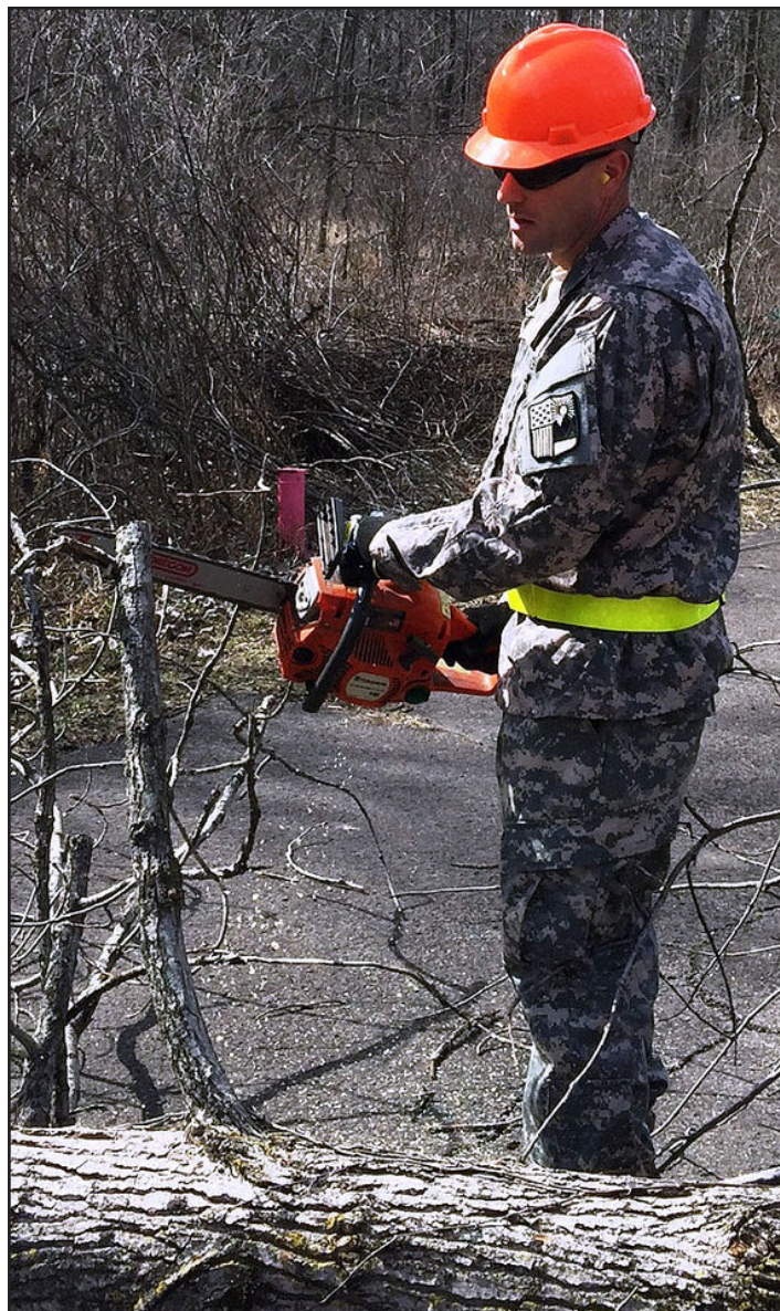
A member of the New York Guard's 65th Emergency Response Regiment clears downed trees at the New York National Guard's Youngstown Local Training Area in Ransomville, N. Y.

The New York Guard traces its history back to 1917 when the New York National Guard was mobilized for service in France during World War I. In the absence of