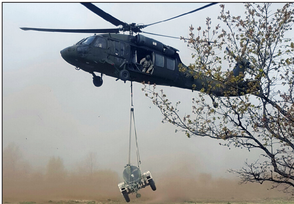
New York Army National Guard aviators of the 3rd Battalion, 142nd Aviation sling-load a trailer of water, known as a water buffalo on May 20.

• 5 CH-47F Chinook medium lift helicopters operated by Company B, 3rd Battalion, 126th Aviation based at AASF 2 in Rochester; and 2 UH-72 light utility helicopters operated by Detachment 2, Company A, 1st Battalion, 224th Security and Support Battalion. These helicopters, based at AASF 3 in Latham, support domestic operations and fly frequently in support of counter drug missions. They are configured with forward looking infrared radar capability and