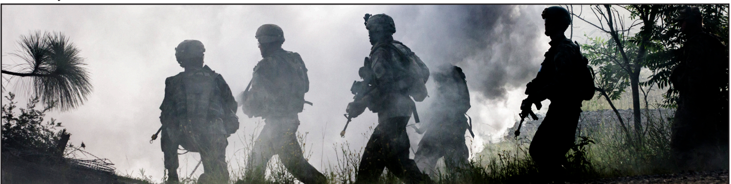
New York Army National Guard Soldiers assigned to the 27th Infantry Brigade Combat Team train at the Army's Joint Readiness Training Center, Fort Polk, La., July 21.

In November 29 Soldiers from the 107th Military Police Company, which is based at Fort Hamilton in Brooklyn deployed to Afghanistan. The Soldiers will serve as personnel security detachment members for International