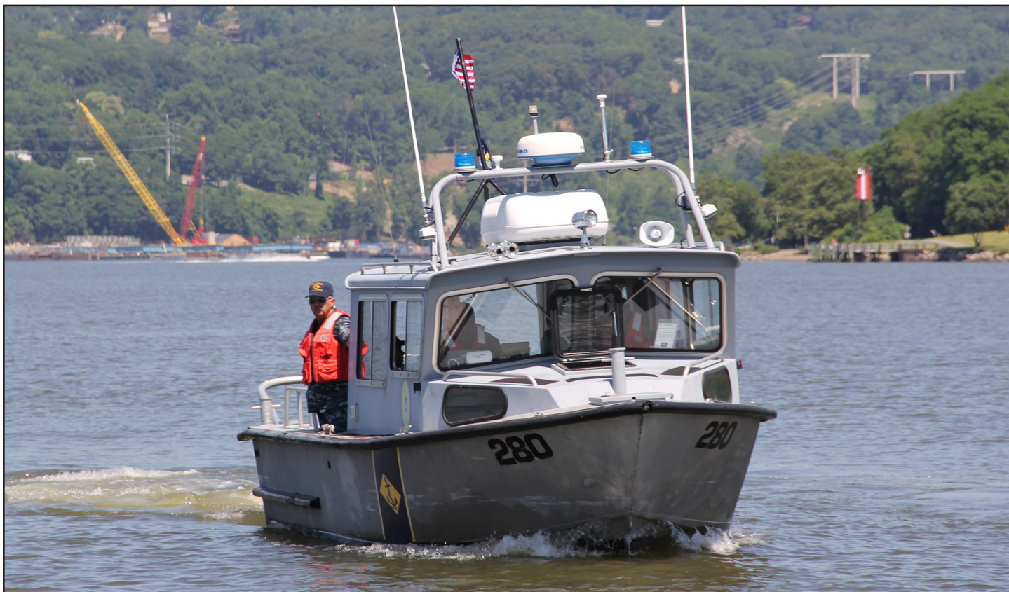
Members of the New York Naval Militia conducted emergency response training, focusing on administrative tasks, logistics and first aid, as well as a small boat exercise in the Hudson River, at Camp Smith Training Site June 17-19.

Patrol Boat 440, a 44 foot-long diesel water-jet catamaran based on Staten Island, carries U.S. Coast Guard inspection parties out to ships waiting to enter New York Harbor