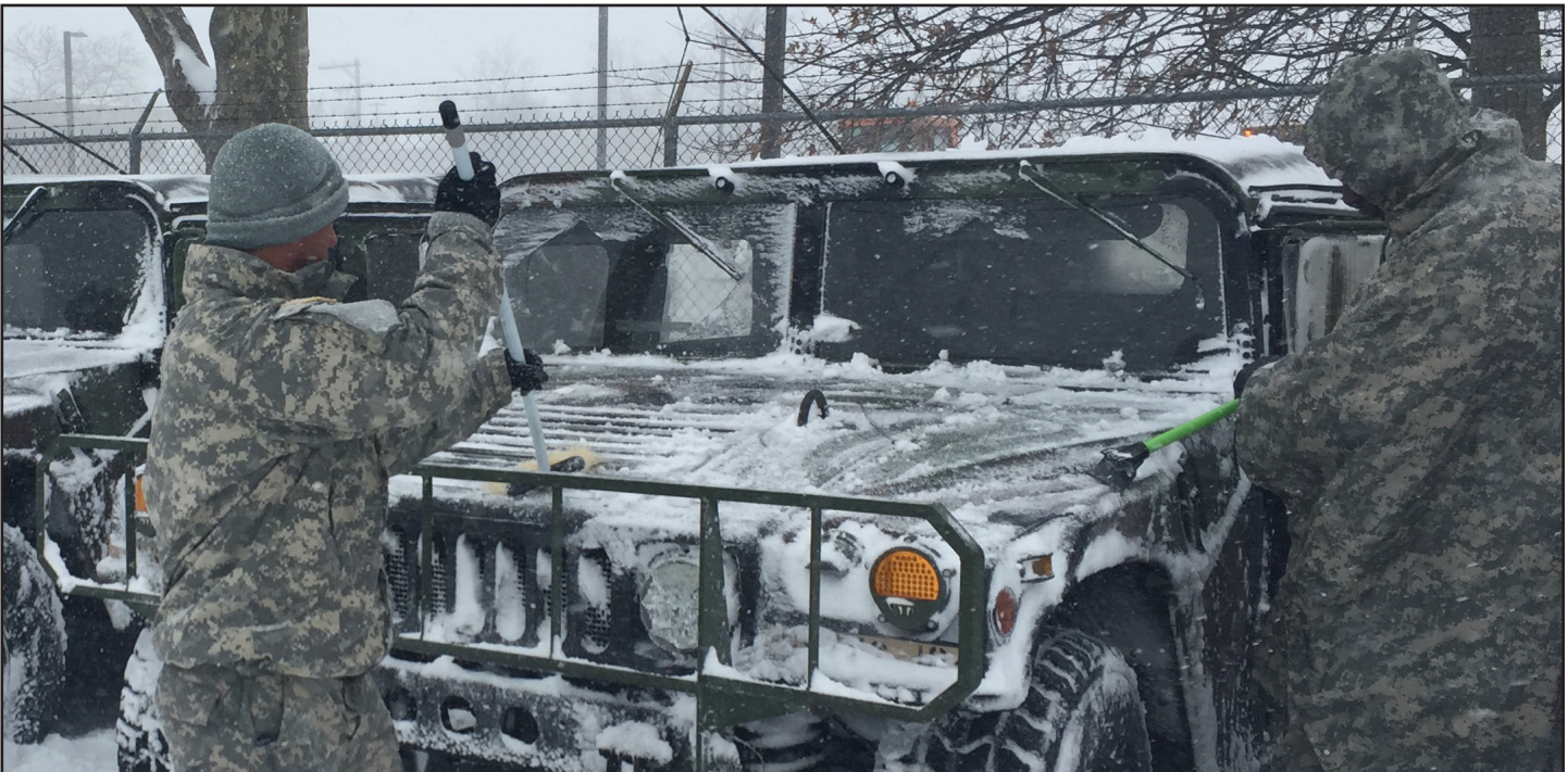
Soldiers assigned to the New York National Guard's Joint Task Force Empire Shield clear snow from Humvees at Fort Hamilton, Brooklyn, on Jan. 23, as a major blizzard hit New York City. The task force, which augments law enforcement in providing security at New York City transportation hubs had more than 100 Soldiers and Airmen on standby to support civil authorities in New York City if necessary.

During the week, 18 EOD teams rescued individuals with simulated bombs strapped to their necks, searched cabins in the woods for