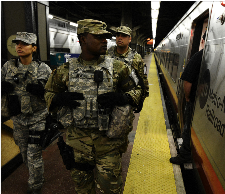
New York Army National Guard Soldiers assigned to Joint Task Force Empire Shield (JTF-ES) provide security in New York City's Grand Central Station in September. JTF-ES boosted its ranks following bombings in Manhattan and New Jersey that month.

During 2016 the men and women of the New York Military Forces -- the New York Army and Air National Guard, the New York Naval Militia, and the New York Guard -- conducted 12,573 missions in support of state and local governments. Missions are defined as a unit of Guard Soldiers or Airmen engaged in a single task for four or more hours.