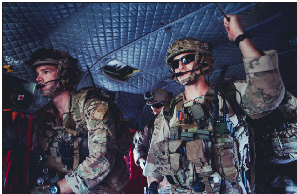
New York Air National Guard Airmen from the 274th Air Support Operations Squadron, Syracuse, N.Y., conduct air assault and parachute jump training Sept. 10, at Fort Drum, N.Y.

During the 2016 federal fiscal year, the 174th Attack Wing invested nearly $2 million in construction costs in its facilities and infrastructure to support mission requirements.