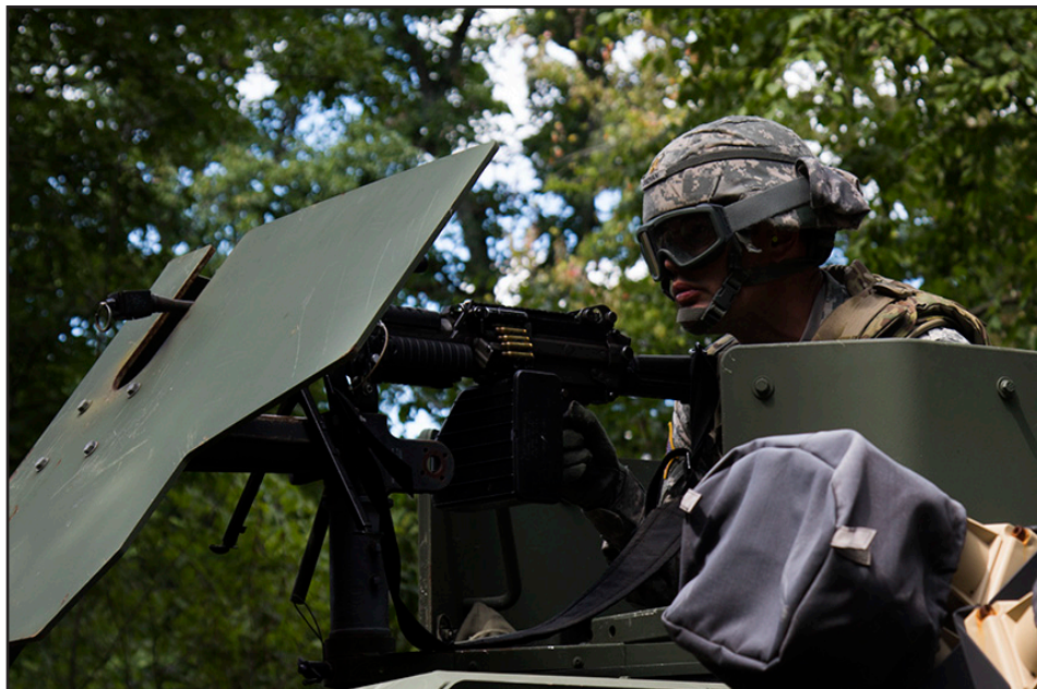
A New York Army National Guard Soldier assigned to the 369th Sustainment Brigade conducts a mounted patrol fight lane as part of pre-mobilization training at Fort Indiantown, Pa., Aug. 23.

The 42nd Infantry Division is responsible for two brigade commands in New York: the 27th Infantry Brigade