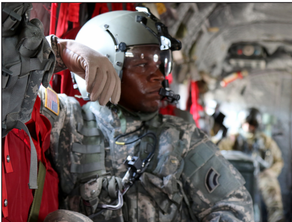
A CH-47 "Chinook" crew chief with B Co, 3rd Battalion, 126th Aviation monitors in-flight operations during a route familiarization exercise at the Army's Joint Readiness Training Center, Fort Polk, Louisiana, July 13.

mand three to four aviation battalions. The brigade exercises command and control over an assault helicopter battalion, an aviation support battalion, an air ambulance company, a heavy lift helicopter detachment and associated elements, and a security and support aviation detachment.