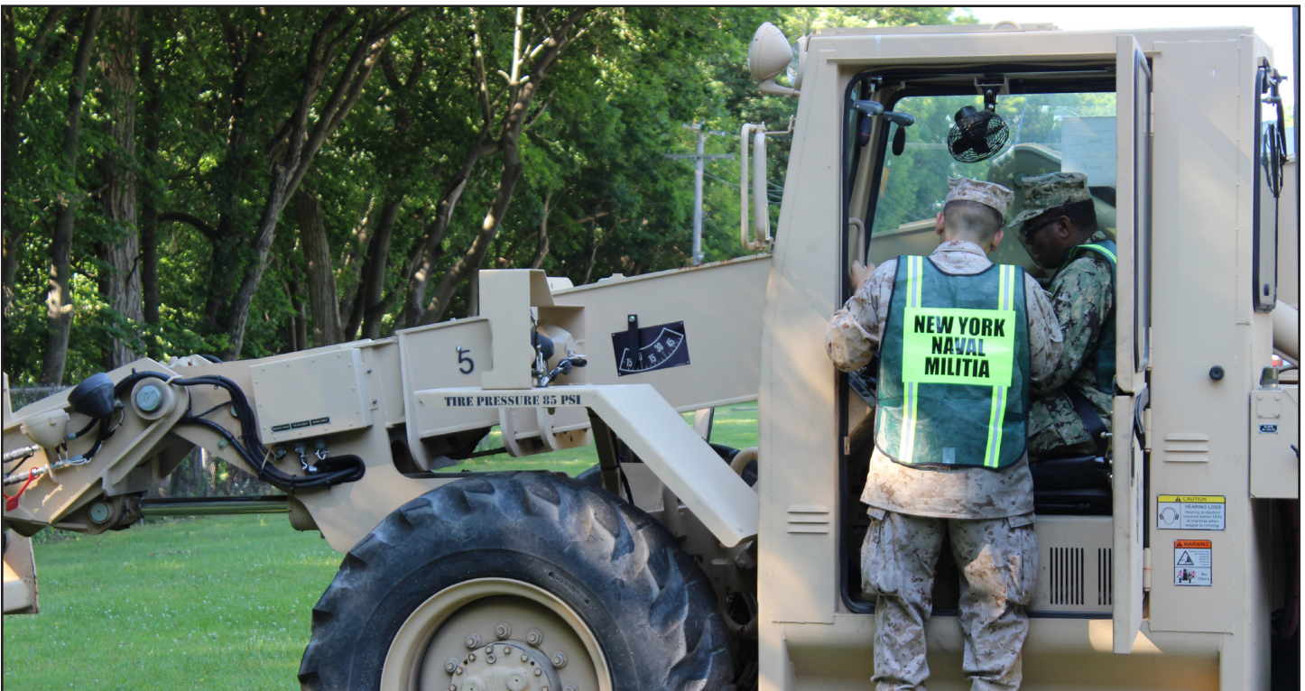
Members of the New York Naval Militia conduct logistics skills training at Camp Smith Training Site, June 17-19.

The Naval Militia is currently in the process of purchasing a 35-foot long landing craft-style vessel which will allow supplies, a vehicle and personnel to be put on shore during an emer-