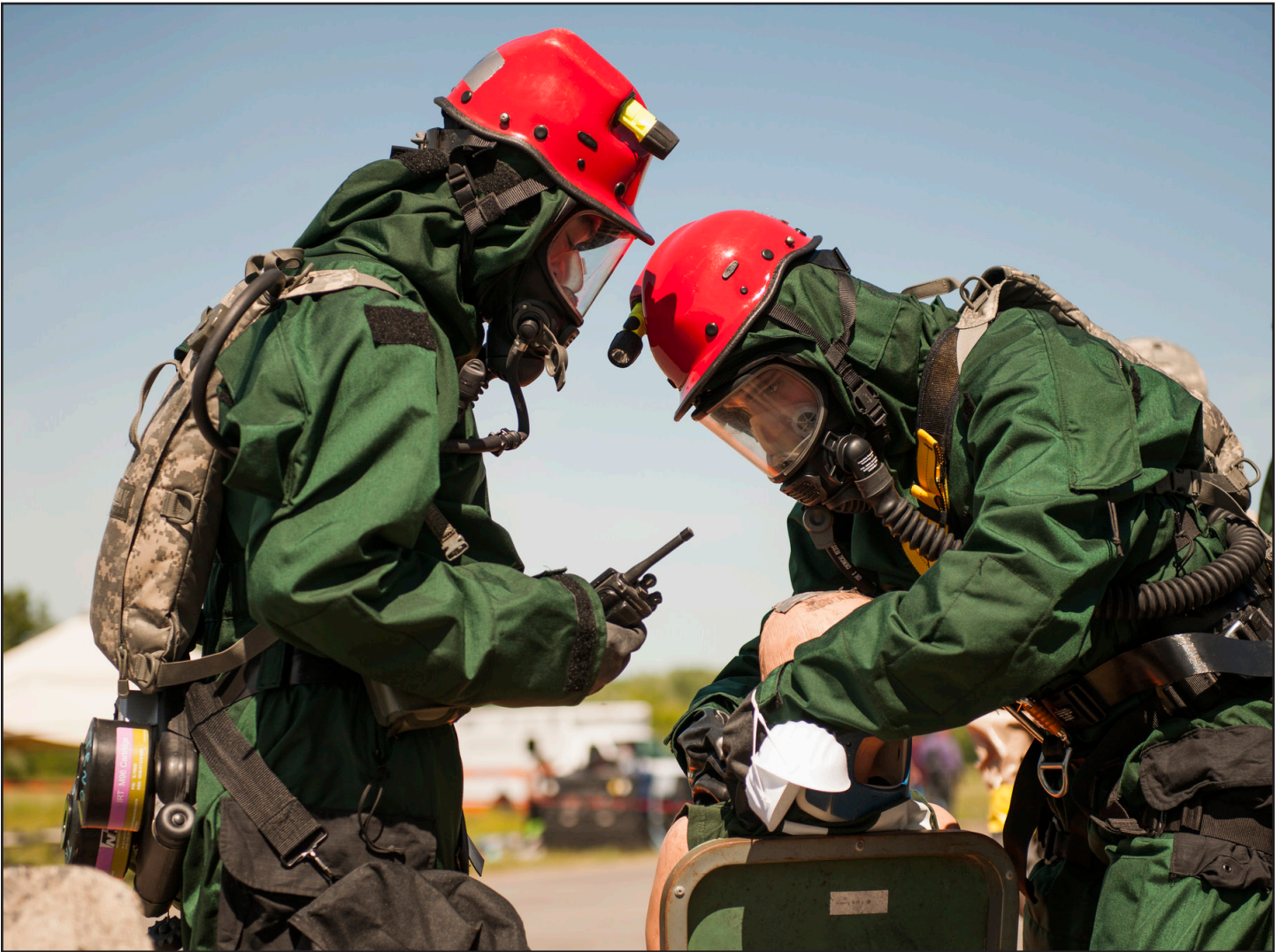
Members of the New York Air and Army National Guard train as a rope rescue team assisting a simulated disaster victim at the State Preparedness Training Center in Oriskany, N.Y. on June 16, during a Homeland Response Force exercise.

hidden bombs, and sweated in green bulky bomb suits. One hundred EOD team members and 90 support staff took part in the exercise.