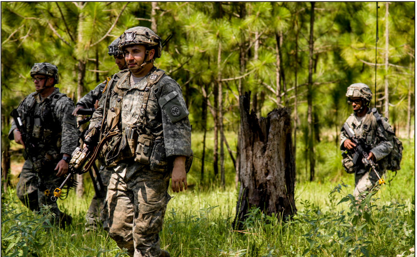
New York Army National Guard Soldiers assigned to 1st Battalion, 69th Infantry provide security and presence patrols around a fictitious village during training at the Army's Joint Readiness Training Center, Fort Polk, La., July 21.