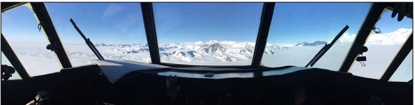
View of Antarctica from a 109th Airlift Wing New York Air National Guard LC-130 "Skibird" operated by members of the 139th Expeditionary Airlift Squadron while participating in Operation Deep Freeze, the military component of the U.S. Antarctic Program, which is managed by the National Science Foundation.

The 109th Airlift Wing also hosted an annual week-long encampment for New York Civil Air Patrol cadets. The encampment included a flight academy, a rock climbing wall, and team activities, as well as numerous leadership opportunities and challenges for the cadets. The culminating event of the encampment was a pass-in-review by the cadets for friends and family members.