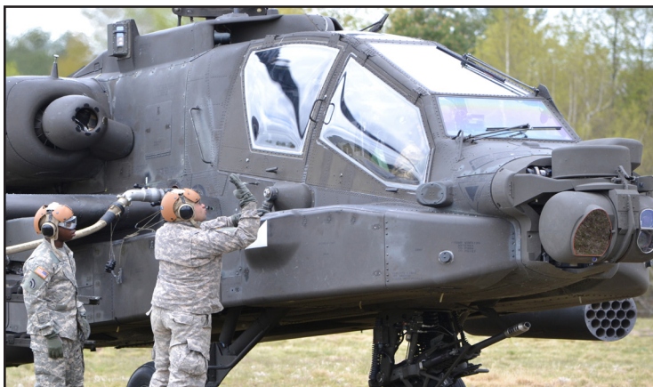
New York Army National Guard Soldiers assigned to the 42nd Combat Aviation Brigade's 642nd Aviation Support Battalion fuel an AH-64 Apache attack helicopter at Fort Drum, N.Y., May 17.

During fiscal year 2016 New York Army National Guard aviators flew 4,800 hours safely and maintained a fleet operation readiness of 80 percent. Fuel costs during the fiscal year were $1,606,350.