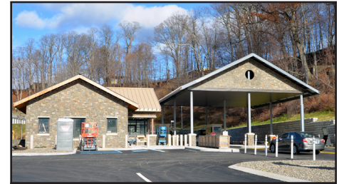
Construction of the new Entry Control Point for the Camp Smith Training Site was completed in 2016.

In November 2016 DMNA finished work on a new entry control point for the Camp Smith Training Site.