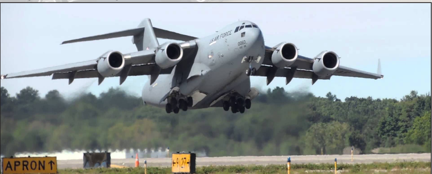
Inset: New York Air National Guard's 105th Airlift Wing loadmasters guide vehicles onto a C-17 Globemaster III. Bottom: A New York Air National Guard's 105th Airlift Wing C-17 "Globemaster" takes off from Stewart Air National Guard Base, Newburgh.

During 2016 the 105th Airlift Wing invested $2 million on facilities and infrastructure repairs and upgrades. This included aircraft hangar door seals and additional anti-fall measures in their fuel cell hanger.